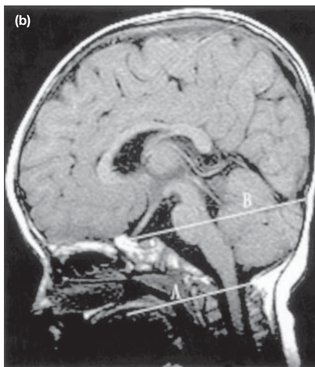
Fig. Osteogenesis imperfecta in a 28-month-old girl

(a) Axial T2-weighted magnetic resonance image of the posterior fossa showing hypoplasia of the left cerebellar hemisphere, which is also medially rotated. The fissures and folia are normal; (b) Sagittal T1-weighted magnetic resonance image of the brain showing mild basilar impression and invagination. The Klaus height index measures 28 mm (A=Chamberlain's line, B=Twining's line)