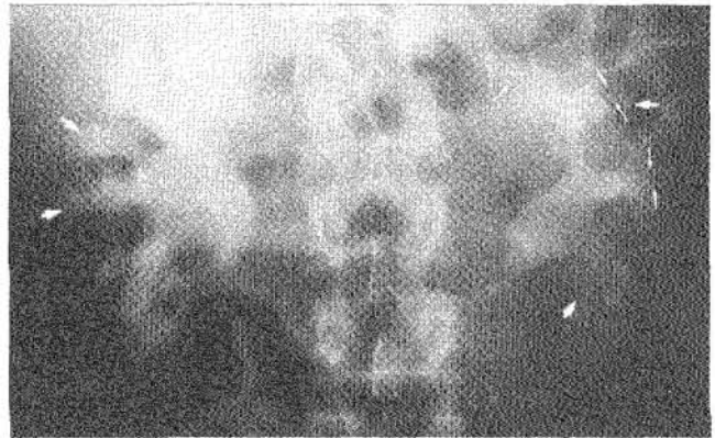
Figure 4: Same radiograph as Figure 2 with the addition of arrows. Both pelvicalyceal systems are opacified by contrast. Tiny cysts (arrowheads) and streaks (small arrows) are present within the enlarged medullary papillae

This disease may affect the whole or part of one or both kidneys. Unilateral involvement is present in 25% of cases. It typically affects young to middle-aged adults, and has an incidence of 0.5%. Uncomplicated disease is usually clinically silent. Secondary infection or passage of calculi, such as in our patient, may produce symptoms. Obstruction by calculi or repeated infection may lead to impaired renal function. Medullary sponge kidney may be associated with Ehlers-Danlos syndrome, parathyroid adenoma or Caroli disease. 1-3