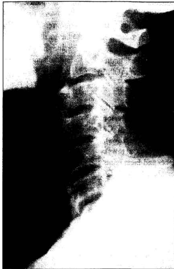
Figure 1: Lateral radiograph of the cervical spine

A 60-year-old man presented with a complaint of long-standing recurrent neck stiffness. There was no low back nor radiculopathic symptoms. Physical examination was normal except for mild limitation of neck movements, particularly during flexion and extension. A cervical spine radiograph was taken ( Figure 1 ).