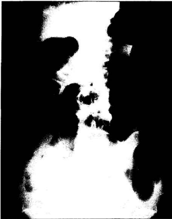
Figure 1: Supine abdominal x-ray