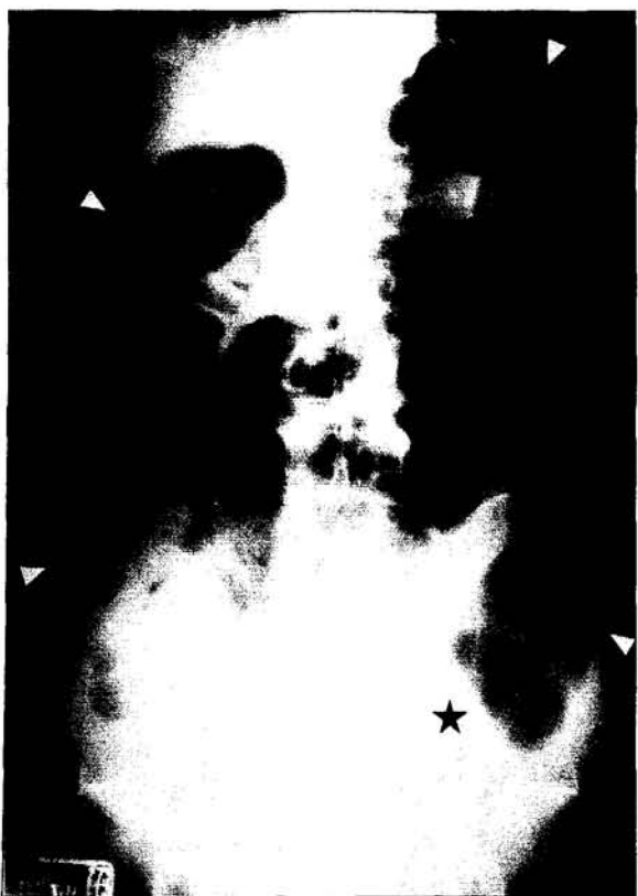
Figure 3: Figure is identical to Figure 1 with addition of arrows. Loops of dilated colon are distributed in the periphery of the abdomen (arrowheads). There is a paucity of gas at the site of obstruction (star)