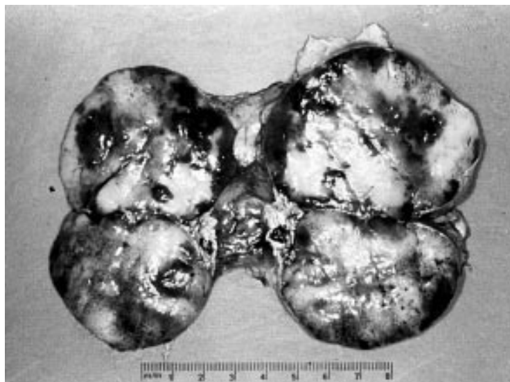
Figure 1 A dumb bell shaped myelolipoma (case 1).

Three patients (two women, one man) with teratomas were noted. They presented with non-specific back pain and adrenal masses