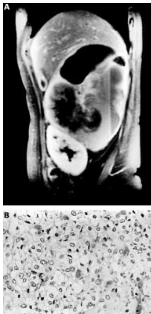
Figure 4 (A) Magnetic resonance imaging showing a cystic right adrenal liposarcoma (case 20). (B) Photomicrograph of the same adrenal liposarcoma showing the presence of lipoblasts. Haematoxylin and eosin stained; original magnification, \times 500 .

incidental findings by imaging and necropsy. Apart from myelolipoma, rare tumours such as lipoma, teratoma, angiomyolipoma, and liposarcoma were also found.