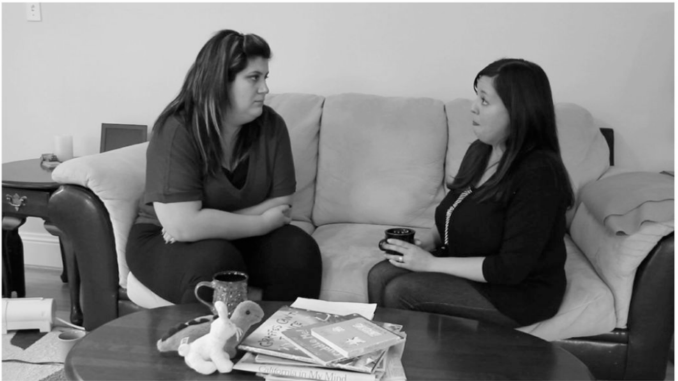
Figure 1. Video Still