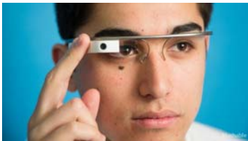
Fig. 1 Left: Google Glass, Right: Google Hearing Aids and App

http://www.glassappsource.com/listing/mashable-velocity-glass-app