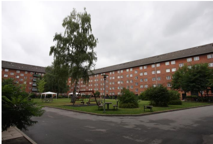
Figure 1: One of the larger inner courtyards in Sankt Kjelds.

A very important aspect of the area is that we have some really large, very green and useful courtyards. The courtyards are open and have playgrounds, barbeque spots and stuff like that. A lot of people will spend their afternoons being social within this courtyard. They meet their neighbors there. That's another reason why it's a bit difficult to attract the same street life that you can do in the inner city.