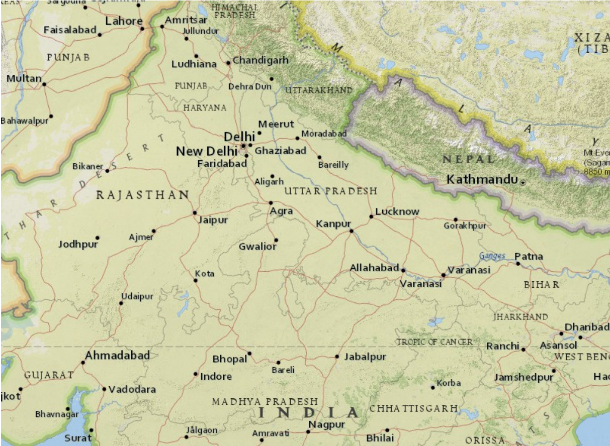
Map 1: Northern India