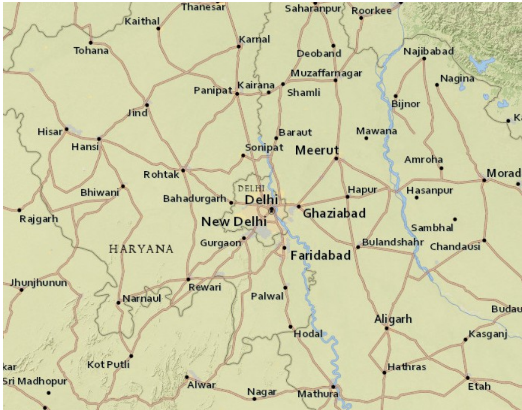
Map 3: New Delhi and surroundings