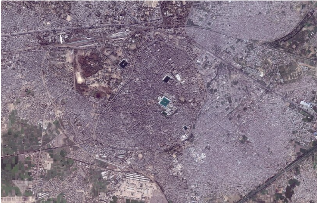
Map 4: Aerial Photograph of Amritsar. Golden Temple, center