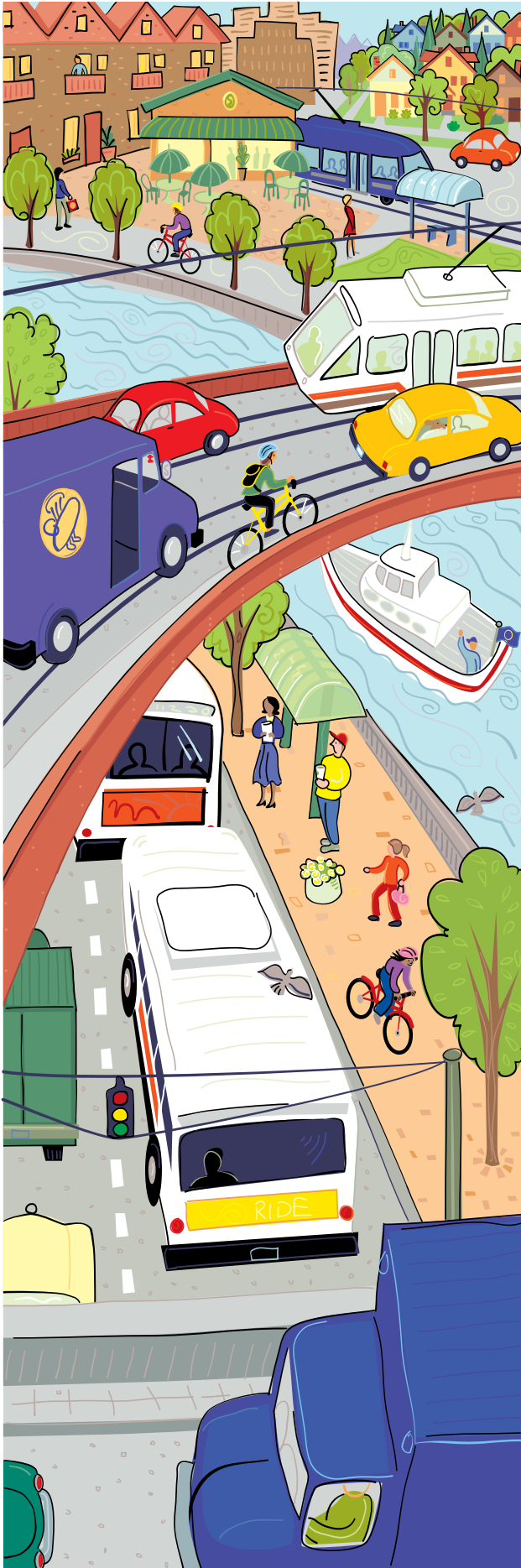
Exhibit A of Resolution 06-3665

Transportation Priorities 2008-11 Allocation Process and Metropolitan Transportation Improvement Program Update