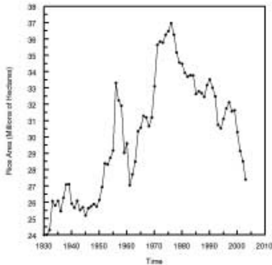
Fig. 2. The area of rice harvested in China over the last 80 years. Of particular importance to the present paper is the decrease of area in recent decades during which time intensive emissions measurements have been taken.

The equation for the annual emissions is the product of two variables: the area weighted average, or composite emission factor; and the total area harvested. Records for the total area harvested are readily available and show decadal trends. These are normally taken into account when calculating the changes in the annual emission rates. But the average emission factor also changes in time due to the shifting nature of agricultural practices. For the case of China, the changing emission factor may be more significant than the change in the area of rice harvested.