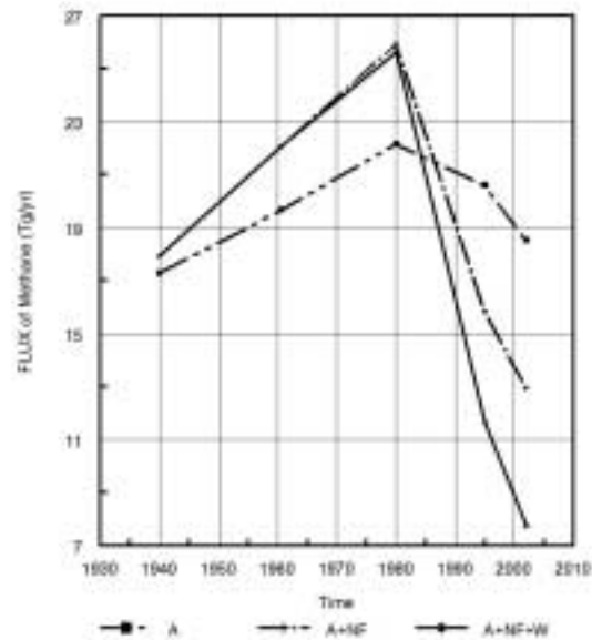
Fig. 3. Estimated emissions of methane from rice fields in China over the last 60 years. The results are reported as averages for 10 year increments until the most recent time, which is an average over 5 years. The highlight is the reduction in emissions over the last 2-3 decades. While some is driven by reduced area, even more reductions have probably occurred due to reductions in the composite emission factor. A = Area only, A+NF = Area and nitrogen fertilizer change, A+NF+W= Area, fertilizer and water use changes.

Finally the emissions calculated as the product of the changing emission factors and the changing area harvested according to Eqn. 5 are shown in Fig. 3 below. It is clear that reductions in area have a relatively small effect on the trends of annual emissions from China while changes in emission factors may result in a substantially greater reduction. Li et al. [27, 28] using an intensive modelling approach, also show a large decrease in methane emission from Chinese rice fields after 1980.