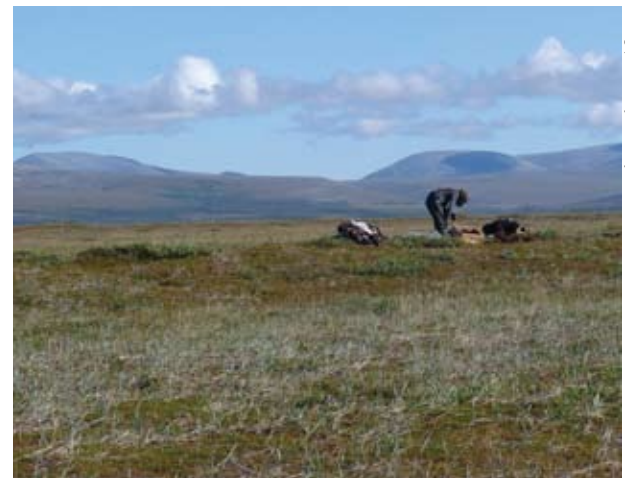
Figure 6. Testing archeological features.