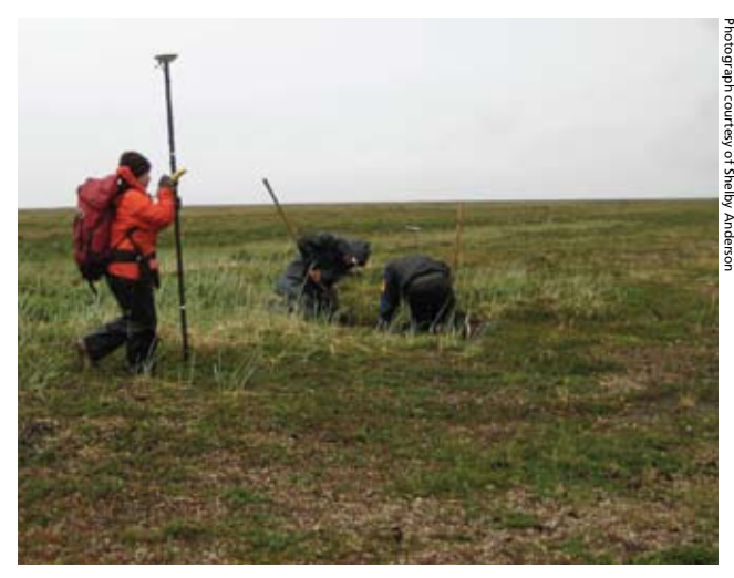
Figure 3. Recording feature with GPS unit.

tures are smaller house or storage features that are not as densely clustered as the large settlements that were the focus of previous investigations. Although new features were recorded in survey areas across the beach ridge complex, many of these features date to the last 1,000 years.