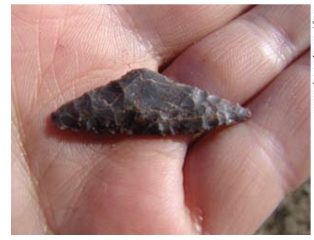
Figure 7. Artifact recovered during testing activities.