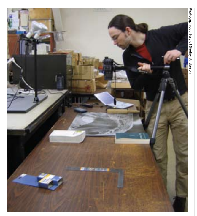
Figure 4. Documenting Giddings' site location information.

In addition to survey and mapping activities, several site areas were tested in 2006 and 2008 ( Figure 6 ) in order to collect well-provenienced samples for dating and other analyses ( Figure 7 ). A total of 19 radiocarbon dates were obtained in 2006, and dating yielded ages from 6420 BP to 280 BP (before present). The 6420 BP date is likely due to accidental sampling of old wood, as the beach ridges themselves did not begin to form until sea level stabilized in the region between 5,000 and 4,500 years ago. Additional samples from the 2008 field season will be submitted for dating in winter 2009.