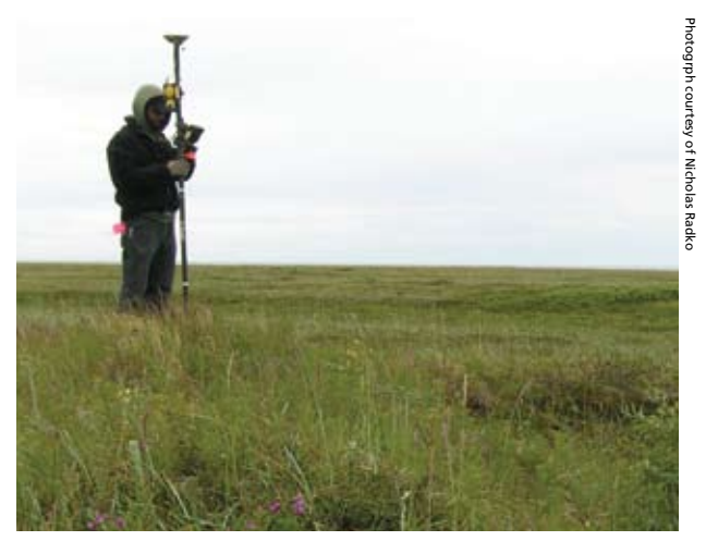
Figure 5. Mapping previously excavated features.