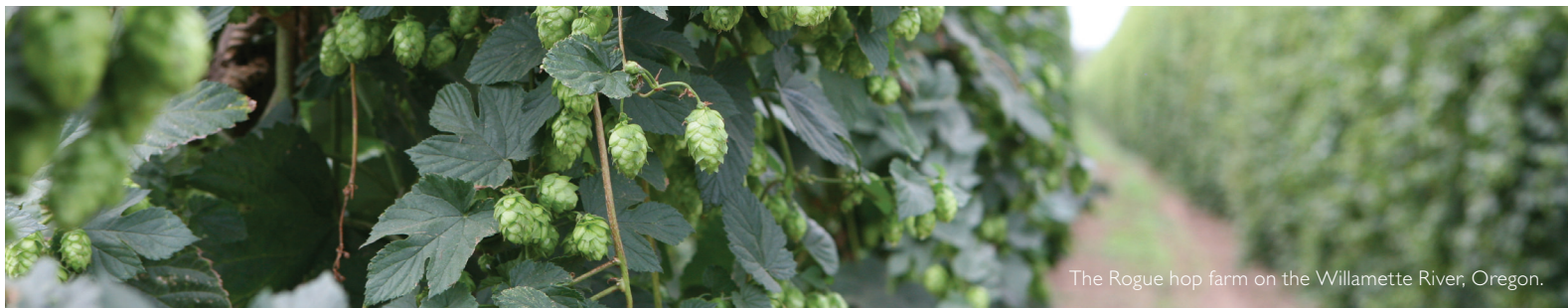
The Rogue hop farm on the Willamette River, Oregon.

Sourcing direct-seed barley would reduce associated greenhouse gas emissions by over 80%