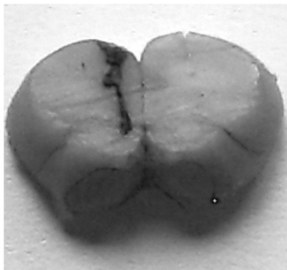
Figure 3 Localization of the microdialysis membrane in the prefrontal cortex.

The intake of food induced significant increases of PFC glucose in both the control and the fish-oil groups. Feeding-induced increase of glucose levels has also been reported in microdialysates of the ventromedial and the lateral hypothalamus of normal rats [40,41]. The fish-oil group showed a more pronounced increase and an earlier response, in comparison to the control group. This event could not be explained considering the carbohydrate content of the diet, since the same amount of this macronutrient was ingested by both groups during the 30-minutes meal. Although the control diet had higher fiber content than that of the fish-oil diet, the small amount of fiber ingested by both groups was probably not effective in producing a relevant difference in nutrients absorption. Furthermore, since the fish-oil group ate more fat than the control group, it is likely that the groups had similar carbohydrates absorption, as the fat content of the diet decreases glycemic index [42].