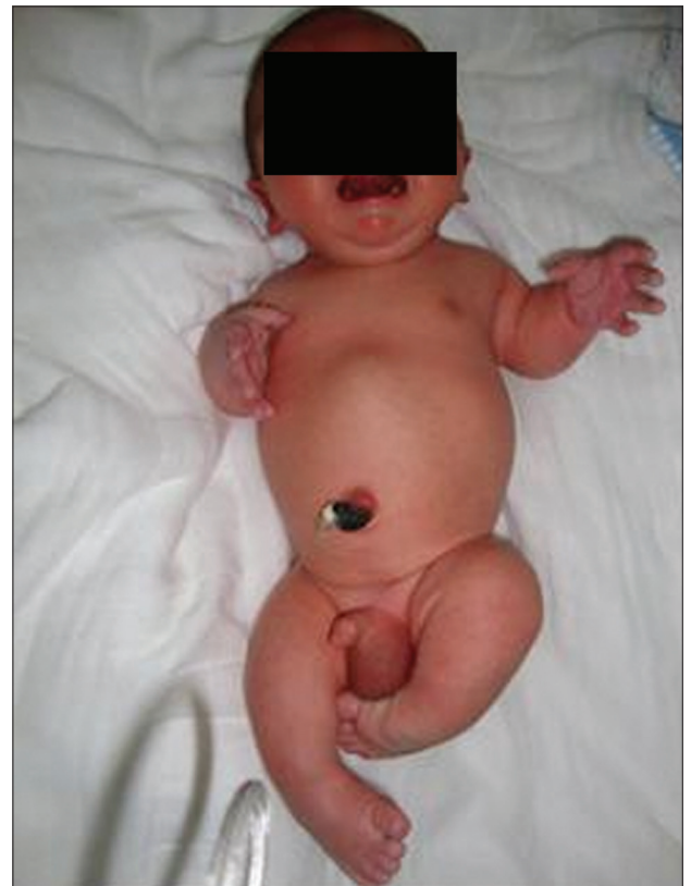
Figure 2. Newborn with diastrophic dysplasia: the first finger can be seen to be in abduction, which is a typical alteration of this pathological condition.

laboratory for a prenatal molecular diagnosis to be made and for genetic counseling to be offered. According to the family pedigree (Figure 3), the parents were carriers of the DTDST gene (line II in Figure 3). The fetus was a compound heterozygote, carrying two different mutations (line III). The black balls (line III) indicate two previous miscarriages. The patient said that she had one brother