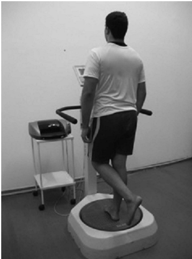
Figure 2 - An athlete performing the platform stability test.

athlete was positioned with his arms parallel to the longitudinal axis of the body while keeping his hand in contact with his thigh. The subject was instructed to keep his eyes open and fixed on a point on a white wall 1 meter from the equipment, and his knees were bent 10° to 15° while keeping his hips in a neutral position. After the three tests, the device software reported the stability index based on the degree of oscillation of the platform during the evaluations.