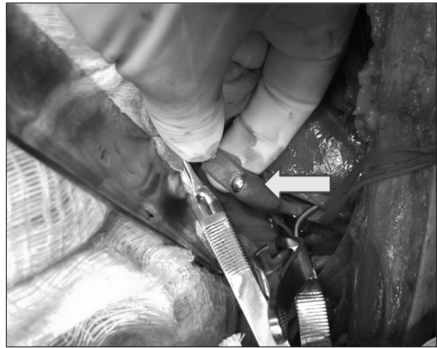
Figure 2. Projectile (arrow) after arteriotomy of the external iliac artery.

“The occurrence of bullets in the blood flow, even if rare, has become more than a surgical curiosity, and its presence must be taken into account when unexpected symptoms are observed after injuries caused by a firearm, especially when the bullet cannot be visualized” 22 . Right after the First World War, in 1917,