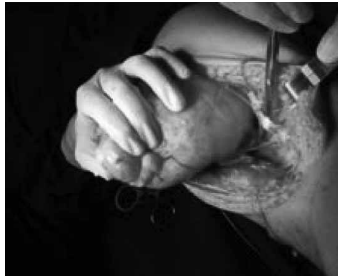
Figure 5 - Intraoperative photograph of the tumor.