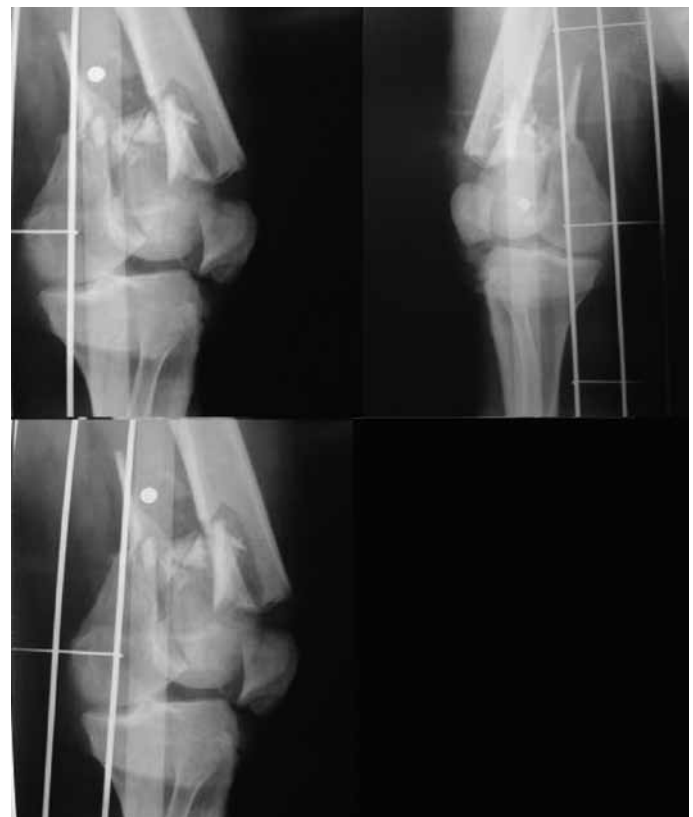
Figure 1 – Preoperative radiographs.

For all these reasons, this case of an exposed supra-intracondylar fracture of the femur in a motocross competitor was reported. The case was diagnosed and treated in accordance with the literature (Figures 1, 2 and 3).