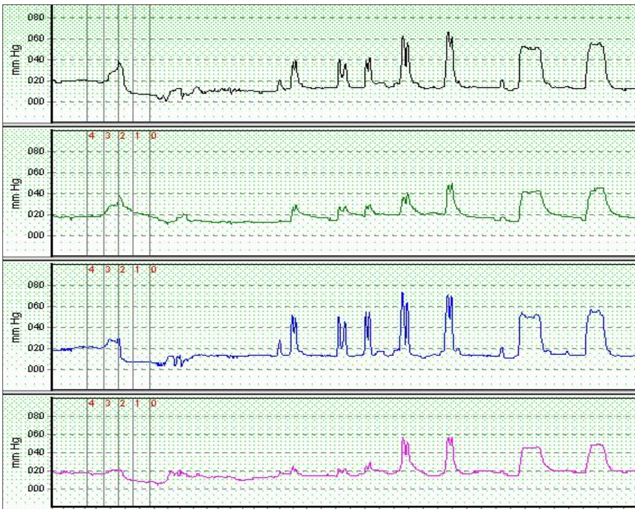
FIGURE 1 - Computerized anorectal manometry using the perfusion technique

Manometries were performed without sedation. All the children received phosphate enema, 10mL/kg (maximum 120mL), about 12 hours before admission. When the fecal retention was important, the children received phosphate enema for 3 to 5 days before being submitted to computerized anorectal manometry. The choice of technique to be used first was randomly established before children were admitted to the anorectal manometry laboratory. In the computerized anorectal manometry using the perfusion technique (Figure 1), a flexible catheter of 4 millimeters (mm) in diameter was used, with 4 radially-distributed orifices and a lumen to inflate a latex balloon at its tip, with a maximum capacity of 200 milliliters (mL).