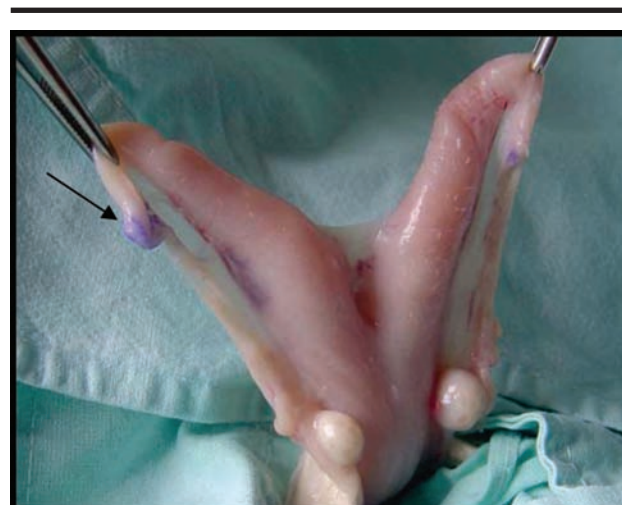
FIGURE 2 – Photograph of a typical uterine tube of group AD. Notice the presence of adhesive patch (arrow) and difference in diameter among the different portions of the tube (20X)