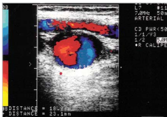
Fig. 1 – Photography of colour Doppler result showing right axillary artery pseudoaneurysm

The colour Doppler revealed an 18 x 23 mm pseudoaneurysm in the axillary artery with heterogeneous atheromatous plaques and spots of calcifications (Figure 1).