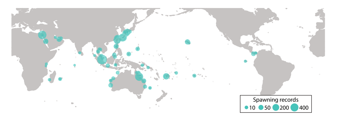
Fig. 1 The number of spawning records by site.