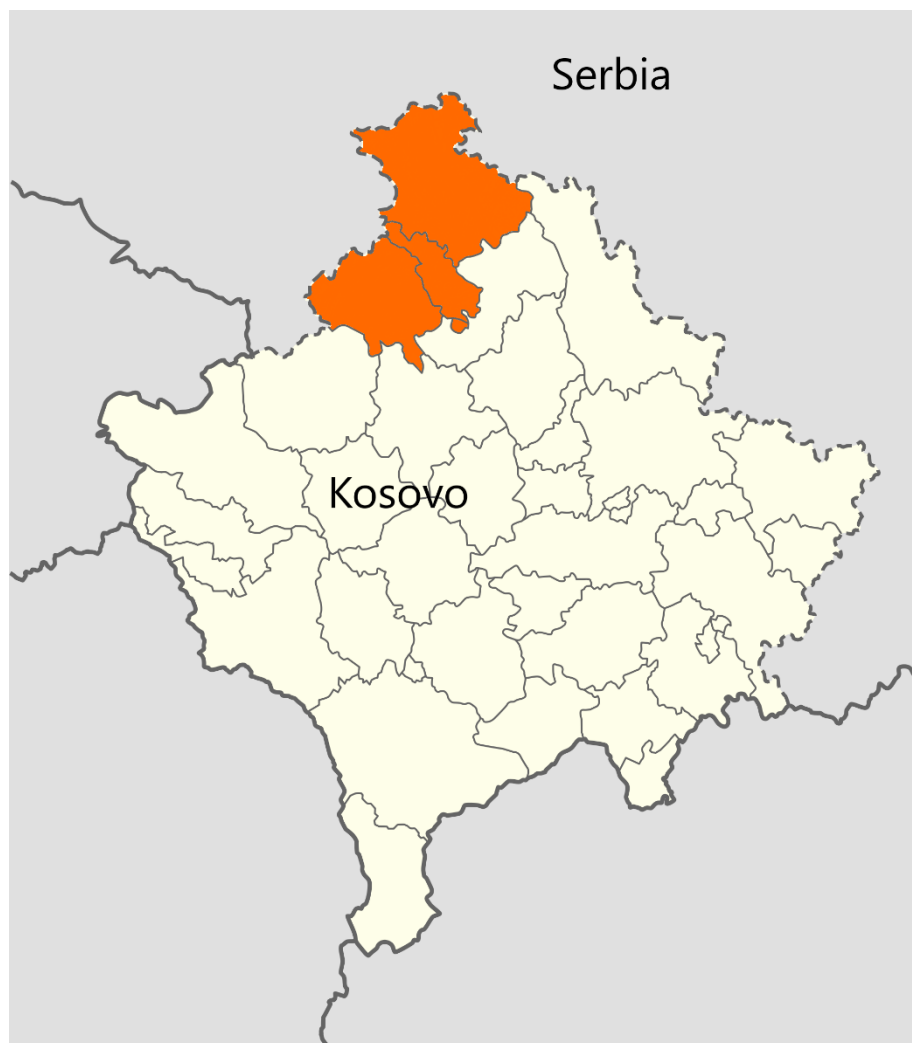
Figure 4 - Map highlighting the four Serb-majority municipalities of northern Kosovo. (Original map by WhiteWriter, distributed under CC BY-SA 3.0 license. Additional text added by author.)

Following the unilateral declaration of independence, then, there was immediate protest and reaction from Kosovo Serbs in the northern municipalities, including some violent clashes, the seizure of a courthouse, and the destruction of customs service points (S/2008/354: §§ 5-6). The Serbian parallel structures in northern Kosovo ‘widened and deepened’ (S/2008/458:§ 2), with the support of the Serbian government in Belgrade (S/2008/458: § 5). Serbia held its own elections in northern Kosovo on 11 May 2008, which UNMIK declared to be invalid ( ibid. , § 6). Furthermore, on the basis of these elections, Serbia established the Assembly of the Community of Municipalities of the Autonomous Province of Kosovo and Metohija, as an alternative to the Kosovo Assembly. While UNMIK’s institution building can therefore be characterised as territorializing the Kosovo assemblage, it is apparent that this process was resisted in northern Kosovo. If the unilateral declaration of independence was an assertion of Kosovo’s stateness, the response in northern Kosovo was to emphasise rejection of the Kosovo government’s authority, further entrenching the parallel structures.