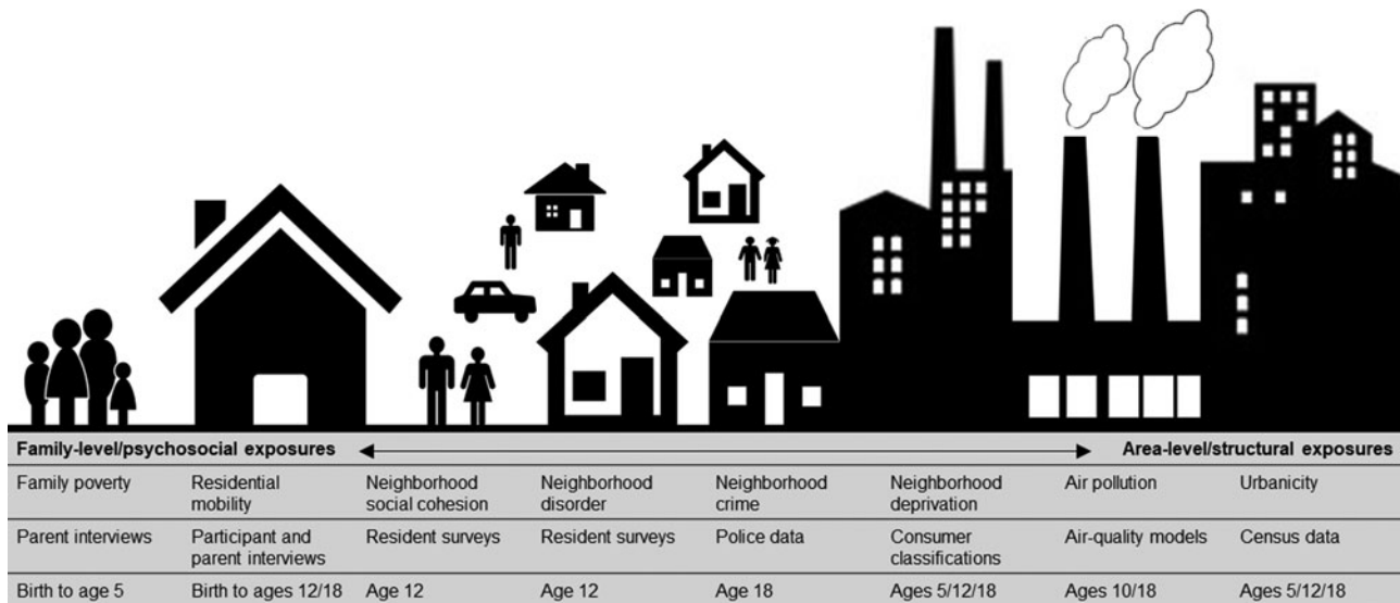
Fig. 1. Illustration of the nature and source of environmental risk variables used in this study.

mothers reported on their own mental health history and the mental health history of their biological mothers, fathers, sisters, brothers, and the twins' biological father (Weissman et al., 2000). This was converted into the proportion of family members with a history of psychiatric disorder (Milne et al., 2008).