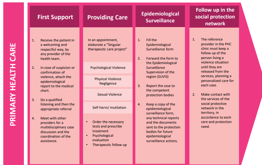
Figure 2. Flow Chart of the PHC for People Experiencing Violence (in Accordance With the Care Pathway Policy). São Paulo Municipality, 2015. 51 Abbreviation: PHC, primary healthcare.

It is a care articulator in the service. It must organize and facilitate the care process and the information.