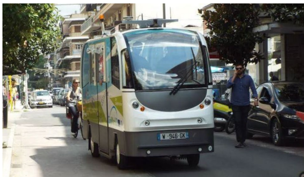
Figure 1. Automated shuttle by Robosoft on a public road in a mixed traffic situation in Trikala, Greece.

Following the recommendations of Anderson and Gerbing (1988), a two-step approach was adopted. In the first step, a confirmatory factor analysis was performed to evaluate the measurement model. This step involves estimating the measurement relationships between the observed variables and their underlying latent variables. Latent variables are theoretical or hypothetical constructs that are not directly measured, which is why they are commonly described as unobserved variables. Latent variables can either be exogenous (i.e., independent), or endogenous (i.e., dependent) variables. The latent exogenous variables in our measurement model are social influence (SI) and facilitating conditions (FC), while the latent endogenous variables are performance expectancy (PE), effort expectancy (EE), hedonic motivation (HM), and behavioural intention (BI). Latent variables are indirectly