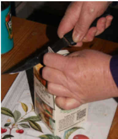
Figure 2. Older adult using knife to open packaging.