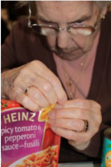
Figure 1. Older adults requiring fine manipulation to access a pack.