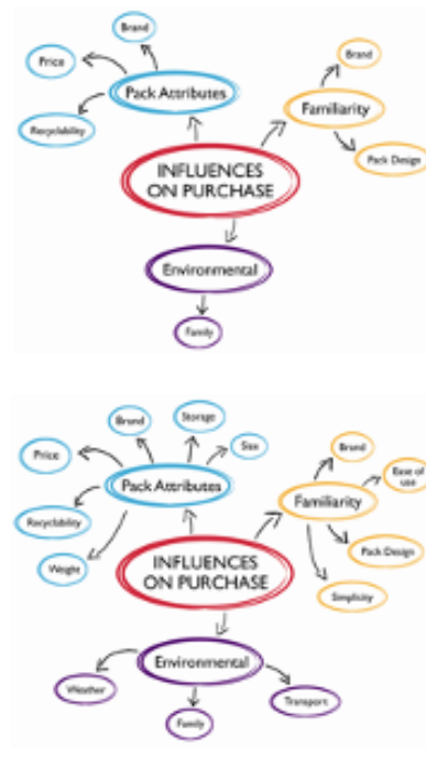
Figure 7. Influences on purchase .

"I and most of my friends (in the 70+ brigade) tend to work things out for ourselves when the packaging creates a problem (where there's a will there's a way). However, it is annoying, and if the problem cannot be solved, that product is rejected at the next shop."