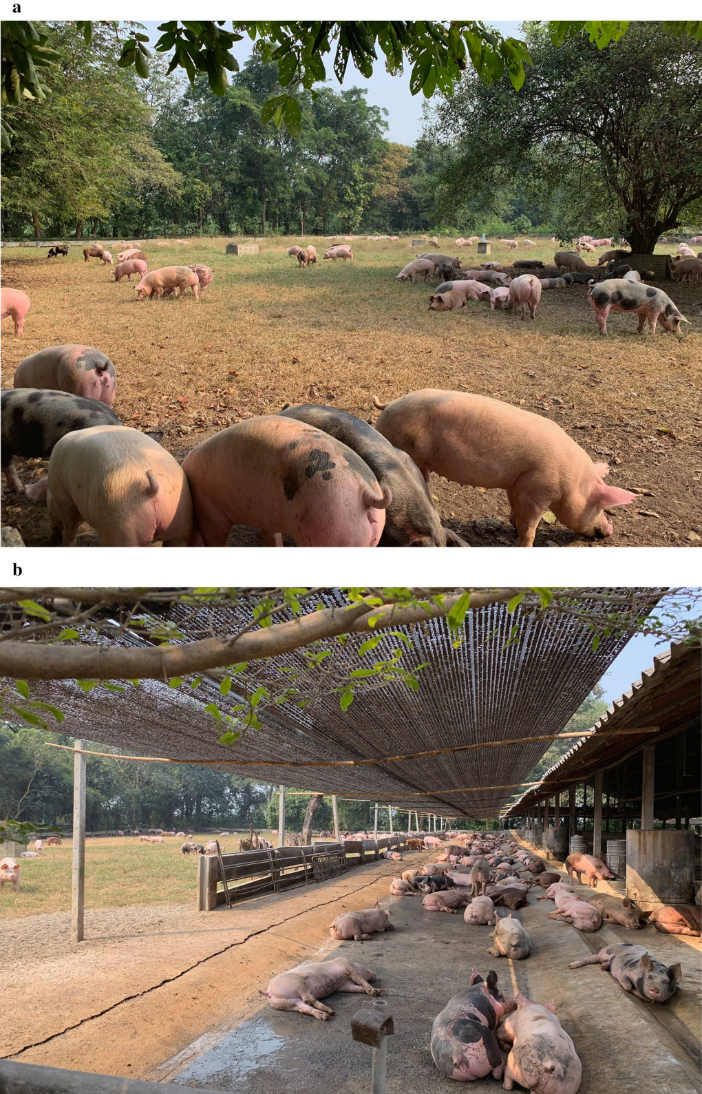
Fig. 1 Pigs in the outdoor area at the antibiotic free farm