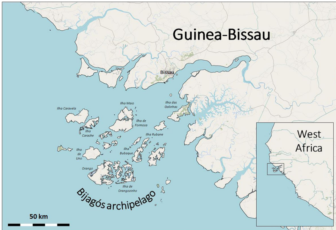
Figure 1. Bijagós archipelago, situated off the Atlantic coast of Guinea-Bissau. Inset shows position of Guinea-Bissau on the coast of West Africa. Adapted from OpenStreetMap. Credit: © OpenStreetMap contributors.

control strategies in general for population suppression. The island study was followed by sustained field releases in a suburb of Juazeiro, Bahia, Brazil. While reductions seen in ovitrap indices, compared with the adjacent no-release control area, were similar to those estimated in the Cayman trials [56], results from a large-scale release in Piracicaba have not been published in academic journals. Challenges in producing sufficient numbers of transgenic mosquitoes can limit the number released per hectare [46] and thus make it difficult to replicate successes in larger areas.