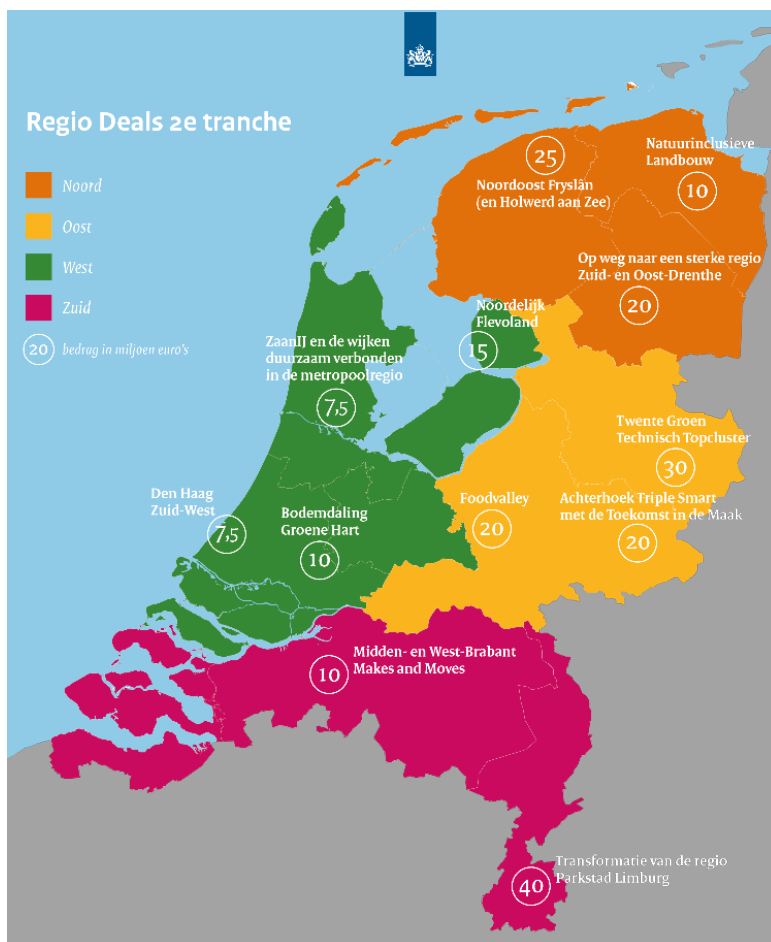
Figure 2: Overview and geographical spread of 12 Region Deals (allocated amounts in mln €) 17

The second tranche of funding is allocated through twelve new Region Deals. The Regional Budget contributes up to a total of €215 mln to these deals. The partnerships that proposed the Deals are a combination of national and sub-national governments, knowledge institutes, civic organisations and businesses. After the final call for proposals (1 September 2018), 88 partnerships expressed their interest in the Region Deals, requesting a total of €1.3 bn. 15 The Cabinet made a final selection of twelve regions (Table 1). The two-page proposals were assessed against the criteria of the Selection Framework (Table 2), and the final decision aimed for a balanced distribution over the four regions (North, East, West, South; see Figure 2), also taking into account the location of the six bottleneck regions. The Confederation of Dutch Industry and Employers (VNO-NCW), an umbrella employer organisation, views the allocation positively. In particular, they highlight the societal and economic impact the Deals enable, and encourage the Ministry to consider the unsuccessful bids in the future. 16 The 12 proposals are currently being developed into 12 Deals, with the aim of finalising the Deals before the summer of 2019.