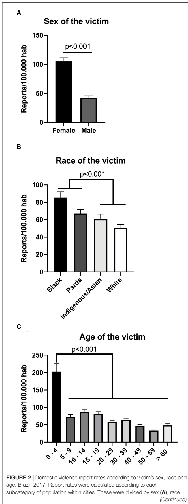
FIGURE 2 | (B) or age (C) of the victim. Data in (A) analyzed through paired non-parametric Wilcoxon test, whereas data in (B) and (C) were analyzed through non-parametric Friedman test with Dunn's multiple comparison test, since data did not pass normality test. P -values shown in figure. Bar graphs express mean \pm S.E.M for 259 observations.

were higher rates for women, black individuals and children under four, highlighting subgroups of the population that were more vulnerable. Indeed, these groups were correlated differently with socioeconomic variables. Poverty, assessed as Bolsa Família investment, was negatively correlated with domestic violence report rates across vulnerable groups, that is, poorer cities tended to present higher rates of domestic violence notifications. Thus, we show that black women and children are more vulnerable to domestic violence and suggest that improving household size, reducing poverty and structural racism would be an effective way to reduce cases of domestic violence.