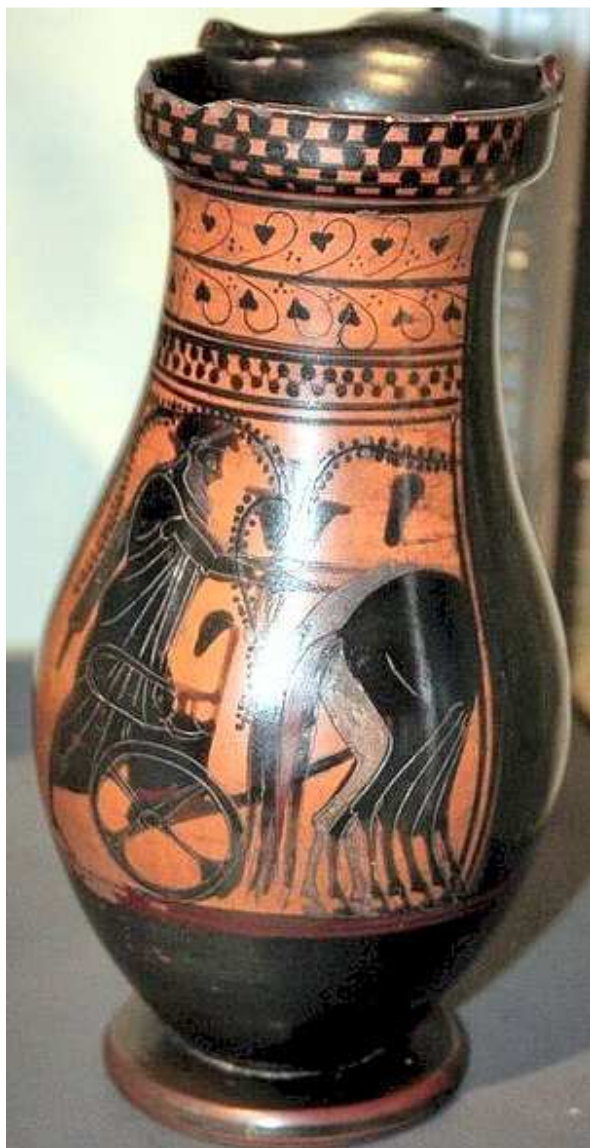
Fig. 2: Attic black-figure olpe, c. 500 BC

potentialities. In short, appearances may be deceiving, particularly to the modern eye unversed in the language of ancient Greek vase painting.