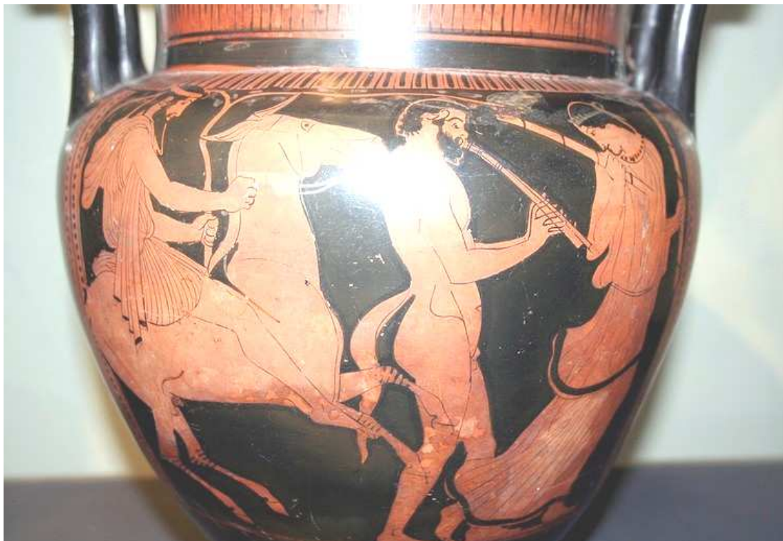
Fig. 4: Attic red-figure krater, c. 460 BC

The absence of Dionysos from this Return scene – an episode in which he was a key participant – may however seem strange. On the other hand, well-established scene types such as this one could be abbreviated (or elaborated) to suit particular conditions (e.g. painter, vase type, picture field and audience), while retaining their narrative intact. The vine stem carried by Hephaistos is perhaps enough to remind the viewer of Dionysos' role in the narrative, or at least evoke the role of drunkenness that was central to the story. 46 In this light it seems Hephaistos, rather than Dionysos may be the most likely candidate here. 47