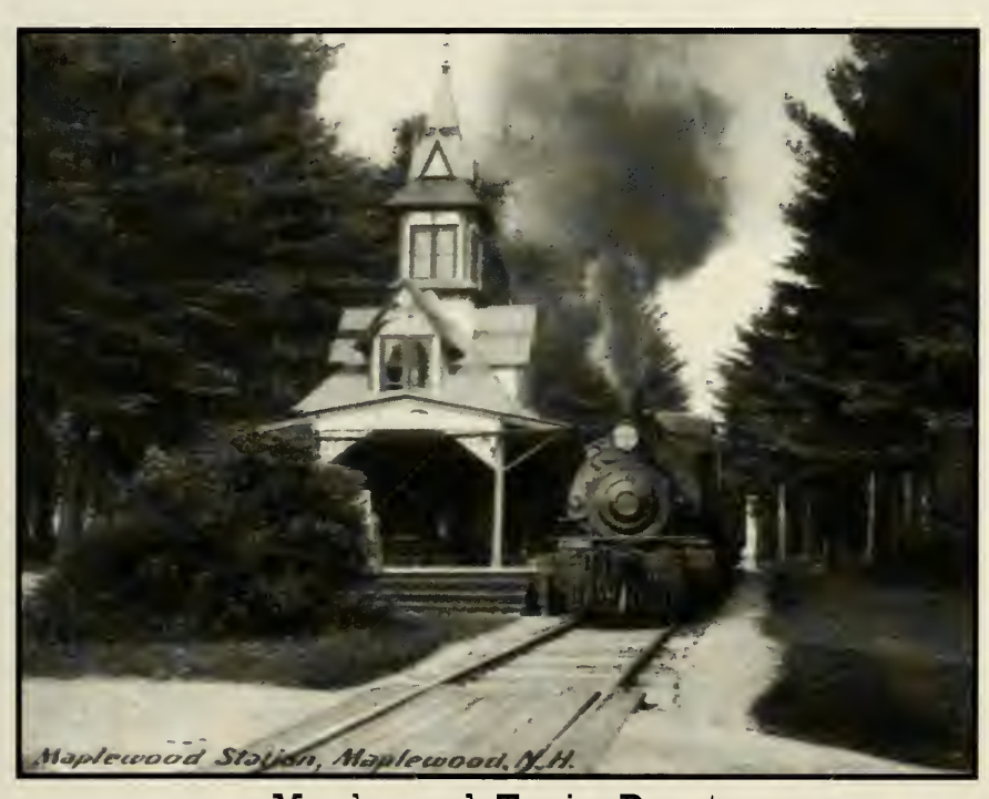
Maplewood Train Depot Maplewood Hill Road 1881 to Present - Abandoned