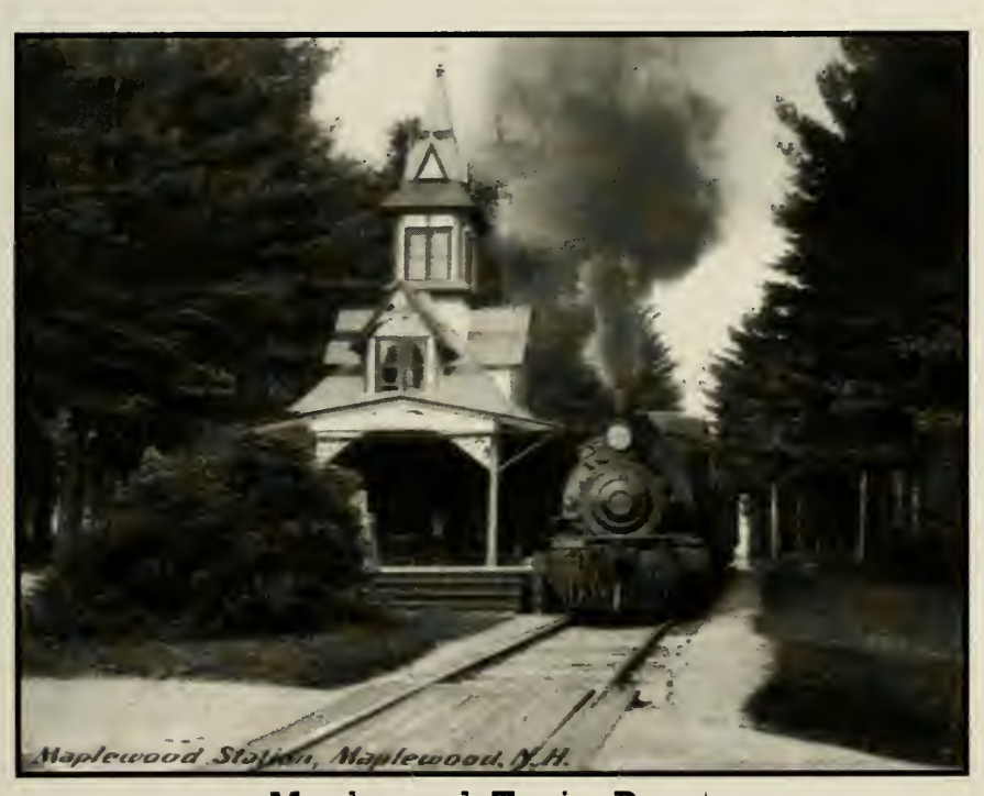
Maplewood Train Depot Maplewood Hill Road 1881 to Present - Abandoned