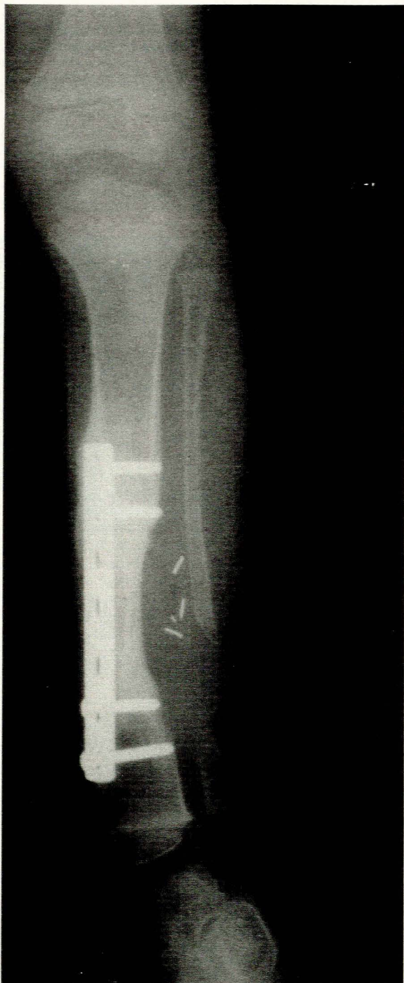
FIG. 3. Fibular graft fixation with plate and screws. Note excellent callus formation.

provide complete stability. We believe that the lack of truly rigid fixation was partly responsible for the problems in these patients. In the last case we discarded the Hoffman apparatus in favour of a plate and screws. This patient rapidly developed impressive callus formation (Fig. 3) and is doing well after 1 year.