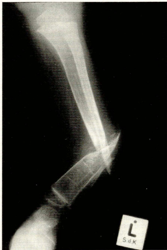
FIG. 1. Pseudarthrosis of the tibia and fibula.

Pre-operative arteriograms of both lower legs are essential. Visualisation of the vascular pattern of the donor leg is important to detect the small percentage of cases in which the peroneal artery is the dominant vessel