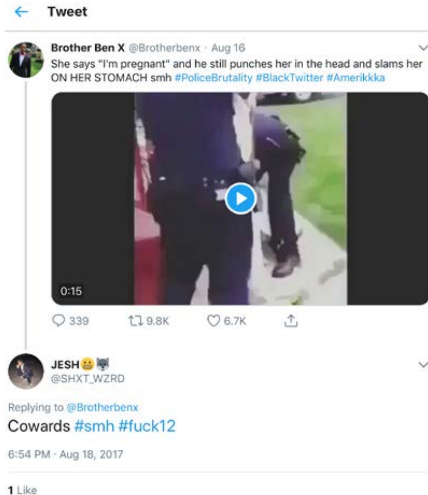
Fig. 11. A tweet from @SHXT_WZRD posted on August 18 2017.

Lindsey's "Herstory: A Brief and Painful History of State Violence Against Black Women and Girls" offers a powerful condensed rendering of this situation as it pertains to Black women and girls: