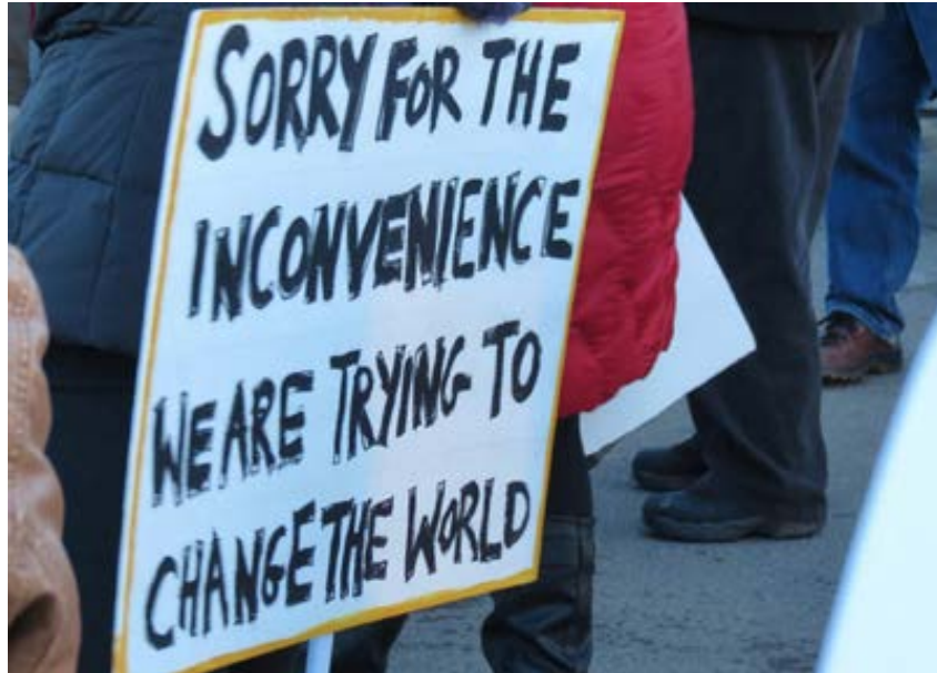
Fig. 7. A sign from a "Black Lives Matter" protest march in Rochester, Minnesota.