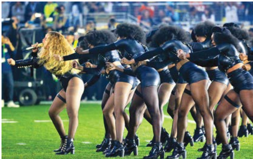
Fig. 10. http://ew.com/article/2016/02/08/beyonce-super-bowl-black-panther/

For example, she “stunt, yellow bone it, grind,” and “slay.” In other words, she “shows off and shows out.” As a light complexioned woman—she “yellow bone it,” (which also includes a play on the word bone , meaning she is a supreme lovemaker). She “grind” or works hard (also pun on lovemaking), and she “slay,” meaning she cannot be outdone in nothing (she is so good, double negative needed)! According to Holliday in Word: The Online Journal on African American English , Beyoncé uses slay 36 times in under five minutes. The lyrics also underscored Black African cultural features, such as “baby hair,” “afros,” “Negro nose,” while the performers were clad in powerfully symbolic Black panther-inspired outfits, shaking and moving with Black woman-power in formation.