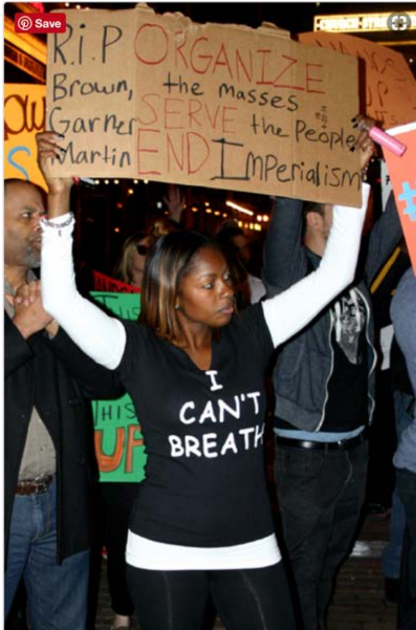
Fig. 5. Patrick Scott Barnes, Black Lives Matter Orlando 12 - I Can't Breathe T-Shirt , Orlando Culture Shock, 11 December 2014, https://orlandocultureshock.wordpress.com/2014/12/11/protestors-stages-die-in-at-downtown-orlandos-amway-center/black-lives-matter-orlando-12-i-cant-breathe-t-shirt/

Similarly, #Fuck12 T-shirts (Fig. 6) highlight a slang phrase that means fuck the police and the anti-Black establishment. The phrase was also incorporated into a popular rap song, "(Trust God) Fuck 12" by Gucci Mane and Rich Homie Quan in 2013.