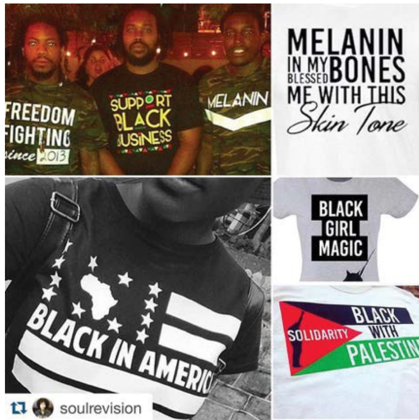
Fig. 3. Facebook post from Roots Collective, December 29, 2015: https://www.facebook.com/ThaRootsCollective/photos.a.778774428845864.1073741828.774442379279069/1019815881408383/?type=3&theater

The words that appear on the shirts have a way of disturbing the peace of people who are trying to ignore or erase the issue of systemic racism. Public displays of movement paraphernalia work to put the issue of state violence against Black bodies in the faces of all passersby.