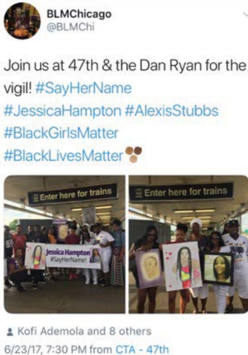
Fig. 12. @BLMChi, Twitter, 23 June 2017

The Pew study observed that Black women's use of Twitter exceeds that of other demographic groups. 5 Sherri Williams highlights particular ways that Black feminists use Twitter to generate movement. She writes: