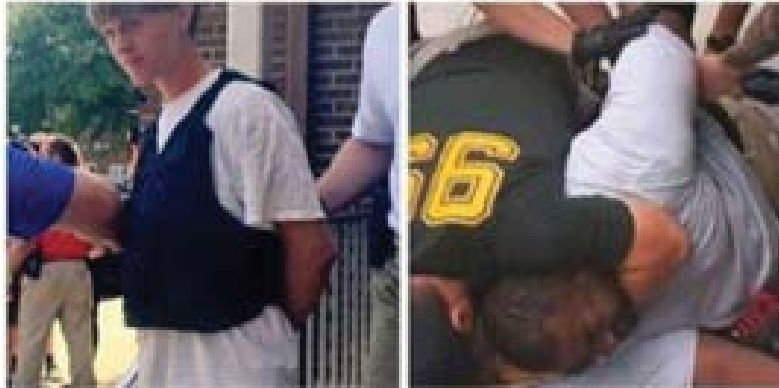
Fig. 14. Charleston Church Shooting in Memes , Grasshopper, 20 June 2015, https://grasshopper-news.wordpress.com/2015/06/20/charleston-church-shooting-in-memes/

This is how you arrest a white man who shot 9 people, and this is how you arrest a black man for selling cigarettes