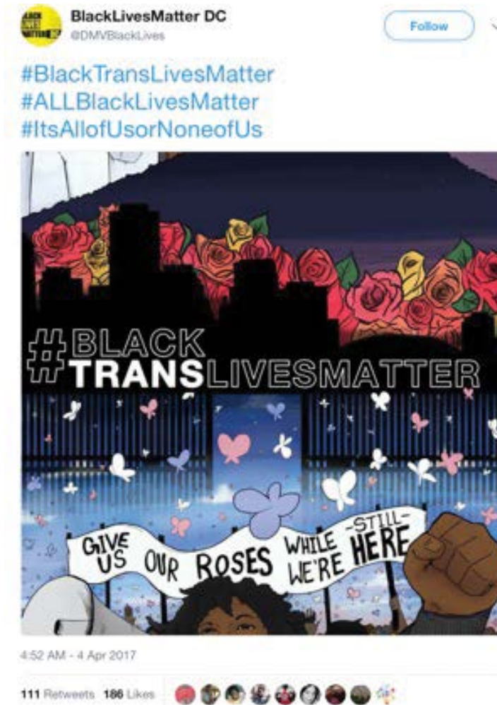
Fig.13. @DMVBlackLives, Twitter, 4 April 2017.

The hashtag #AllBlackLivesMatter has also been important in acknowledging intersectionality of the movement. Black queer and trans people, Black working class and poor people, undocumented Black people, and Black people with disabilities, are typically rendered invisible in the dominant discourse, and even in the Black community, while the experiences of straight, male, cisgender, able-bodied and middle-class Black people are privileged. The hashtag #AllBlackLivesMatter is a way of distributing the idea that all Black life is sacred regardless of income, sexual orientation, gender, age, (formerly) incarcerated, or (dis)ability.