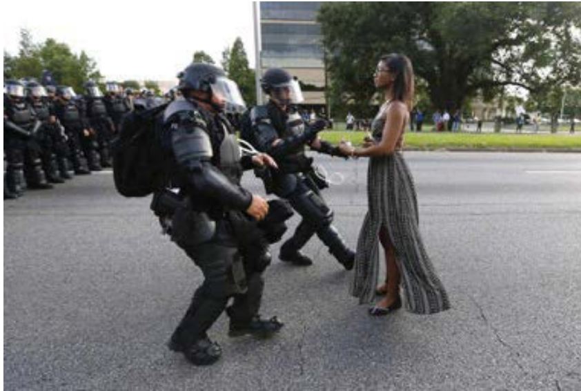
Fig. 2. Jonathan Backman, A Single Photo From Baton Rouge That's Hard to Forget, The Atlantic, 10 July 2016, https://www.theatlantic.com/notes/2016/07/a-single-photo-that-captures-race-and-policing-in-america/490664/

We next emphasize performance and style through signifying practices. Gee's discussion of semiotics is helpful as he underscores sets of "practices that recruit one or more modalities (e.g. oral or written language, images, equations, symbols, sounds, gestures, graphics, artifacts) to communicate distinctive types of meanings" (18).