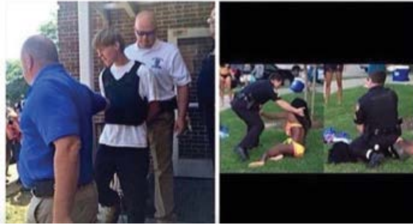
Fig. 15. All bad , Imgur, 18 June 2015, http://imgur.com/2FmvdHV

how police handle a man who just killed 9 people vs how they handle a teenage girl at a pool party. America.