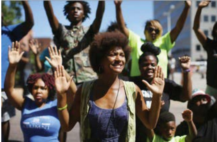
Fig. 9. Scott Olson, Hands Up, Don't Shoot , Vox, 13 August 2014, https://www.vox.com/2014/8/13/5998591/hands-up-dont-shoot-photos-ferguson-michael-brown

the protest phrase “hands up, don’t shoot.” This gesture is often accompanied by the chant, “Hands up, don’t shoot!” The hands-up gesture is a widely recognized symbol used to raise awareness that many Black people have been shot by police even when they had their hands up.