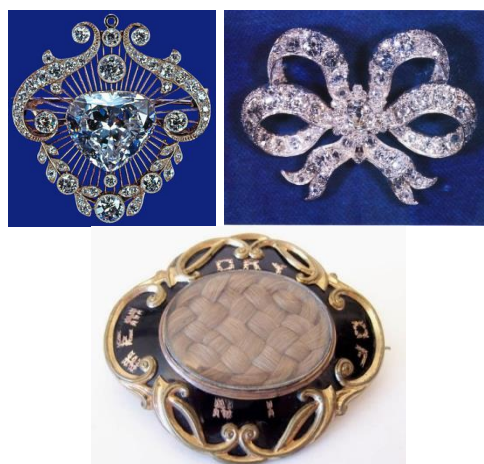
Figure 2. The example of an agrafe brooches

pins on the clothes that fastened the collar of undershirt, or simply were put on for decorative purposes – came into fashion. More precious stones appeared on the adornments of the Middle Ages, as well as more complex images: the scenes of spiritual and religious content, animalistic images, as well as inscriptions, emblems and mottoes (Figure 2).