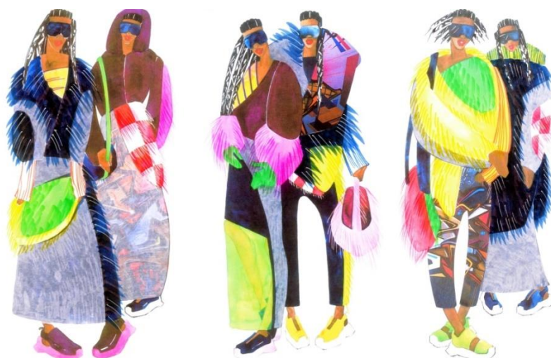
Figure 6. The sketches of the collection of clothes, developed on the basis of combination of fur of different colors