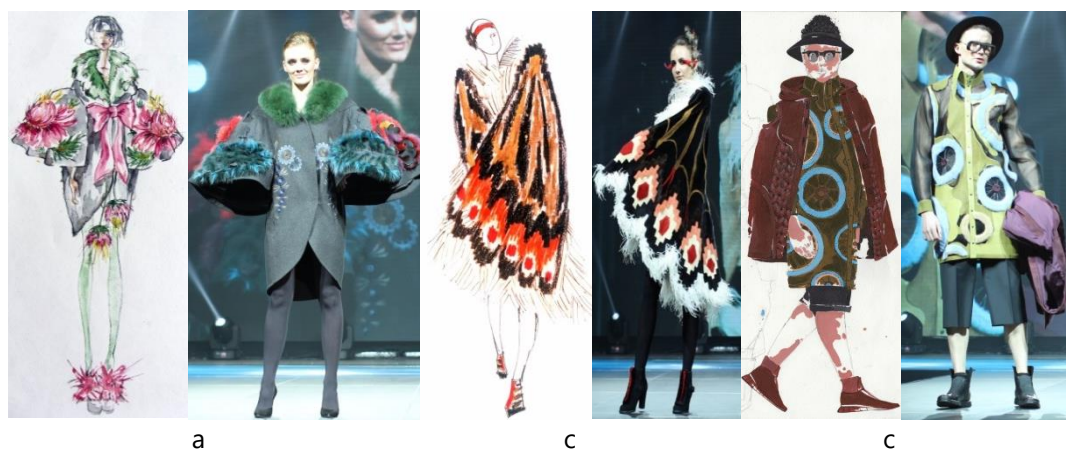
Figure 7. The use of various creative sources for the development of fur garments, competition works of the students of KNUTD: a – Petrykivka painting (author N. Gubal); b – the bionic object the butterfly (author M. Muravitskaya); c – art deco style (author Y. Brigida)