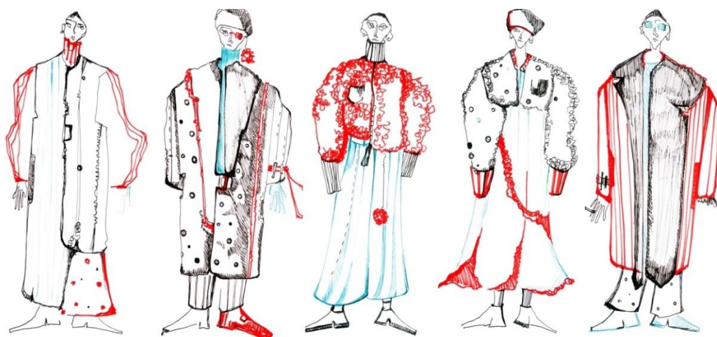
Figure 5. The sketches of the collection of fur man's garments of increased volumetric shape