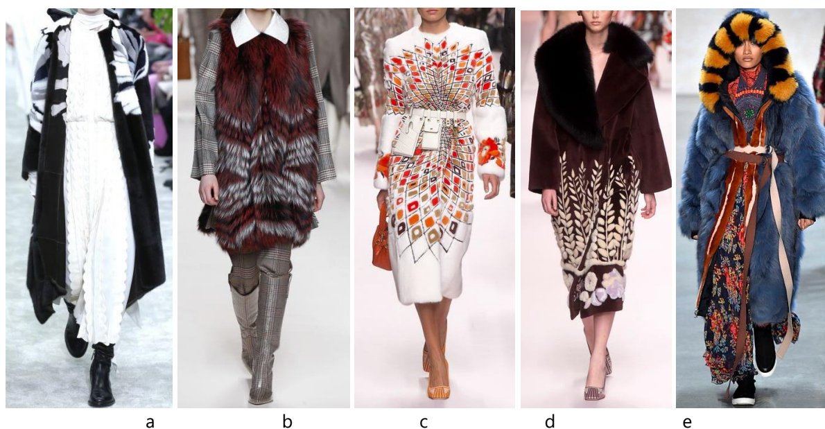
Figure 1. The models that are relevant in the fashion direction: a – fur coat made of mink, with incrustation; b – fur vest made of fox, with a split, Valentino; c, d – prints and incrustation on fur garments, FENDI; e – volume fur coat, Vivienne Tam [14]

Consistency and subordination of its elements, as well as clearly expressed compositional center and a competent placement of accents, all the above contribute to the achievement of unity in asymmetric composition. The asymmetry in fur garments can appear both in the cut and in the color or texture solutions for individual details, as well as in combination of different types of fur or in fur processing (Figure 2, b).