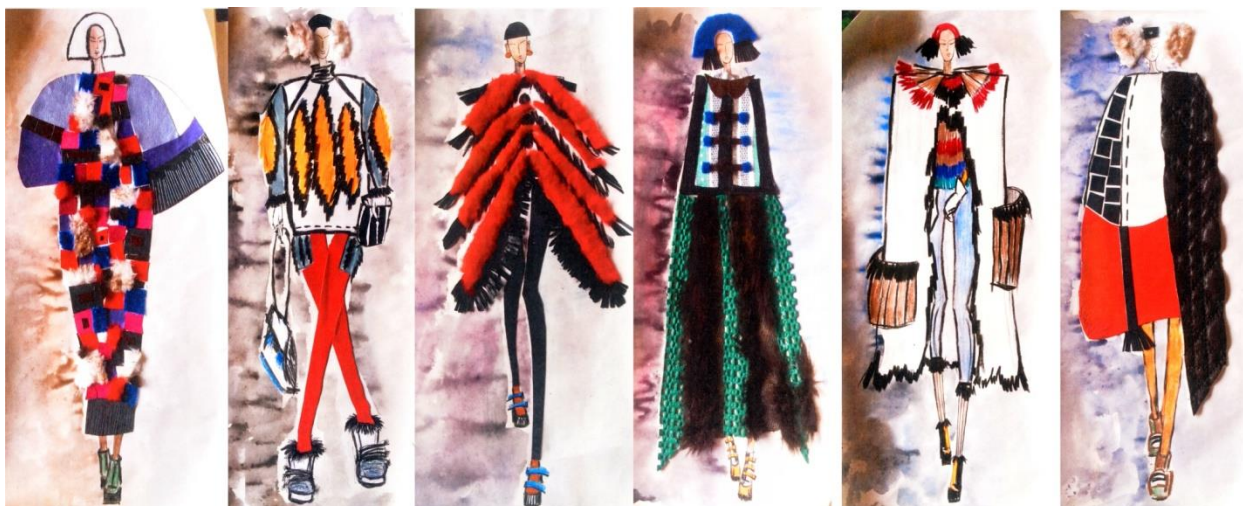
Figure 3. The sketches of the collection of garments, developed under the principle of contrast on the basis of combination of fur of different textures and colors