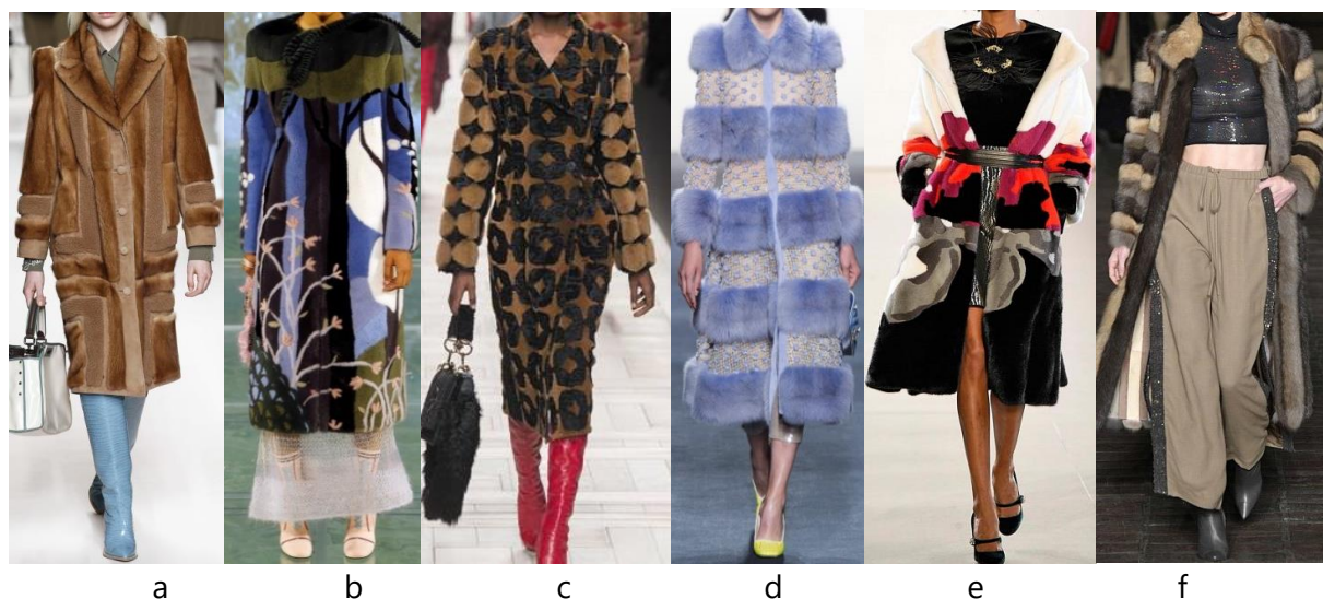
Figure 2. The methods of composition in modern fur garments: a – symmetry, Givenchy; b – asymmetry, FENDI; c, d – rhythm, FENDI; e – contrast, Bibhu Mohapatra; f – identity, Blumarine