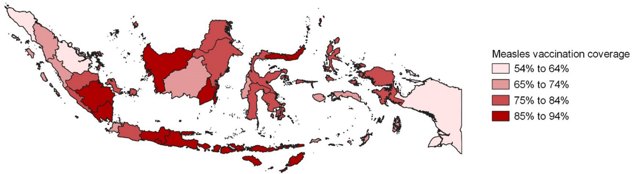
Figure 1. Measles vaccination coverage in children aged 12–23 months by Indonesian province, 2017 DHS. DHS, Demographic and Health Survey.