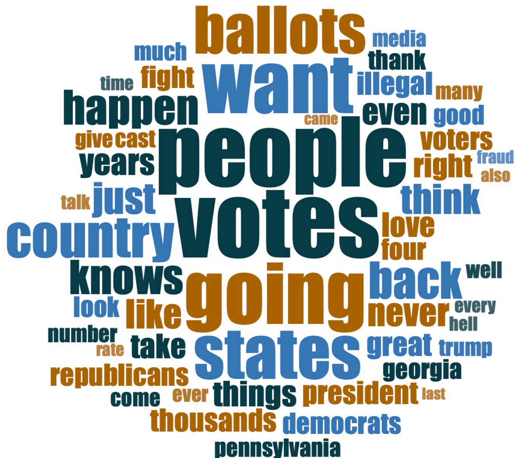
Figure 3: a word cloud of the transcript of Donald Trump's speech at the Save America-rally on 6 January 2021 in Washington, D.C.

Just like on Twitter, Trump also in this speech over and over repeated the false claim that the election was stolen from him and his followers: