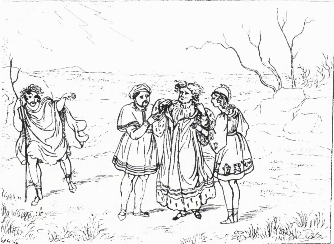
Priscilla Horton as the Fool in the Covent Garden performance of January 1838, taken from King Lear , ed. R.A. Foakes (Arden, 1997)