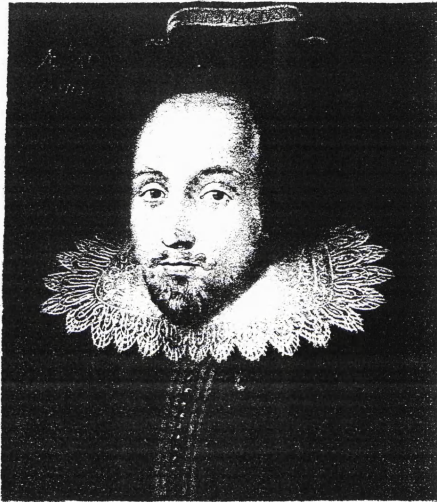
WILLIAM SHAKESPEAR .