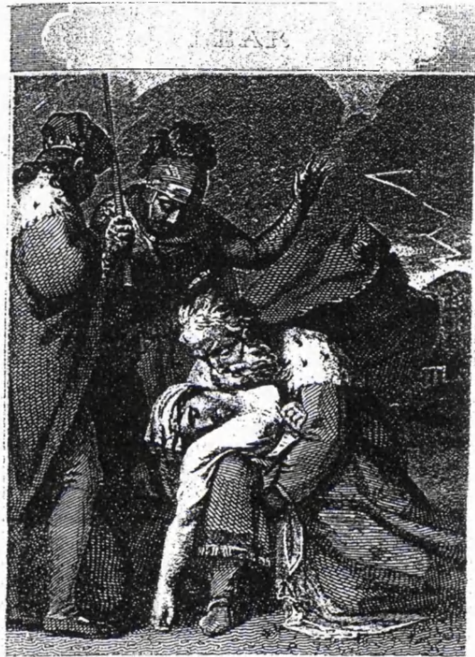
King Lear in The British Theatre (1806-1809) with a frontispiece showing Cordelia dead in Lear's arms but with a text in which Cordelia survives, taken from BL 1507/312 (5)