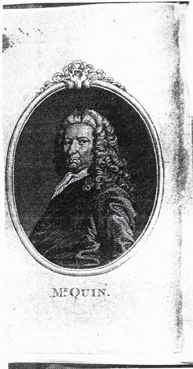
Portrait of James Quin, the leading actor before the arrival of David Garrick, taken from BL. 1418.c.34 (1)