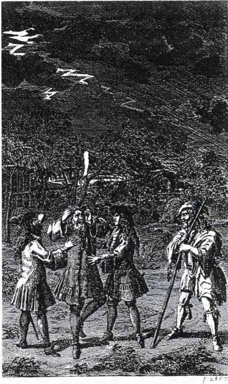
The frontispiece of Nicholas Rowe's King Lear (1709) taken from BL. C.123.fff.2