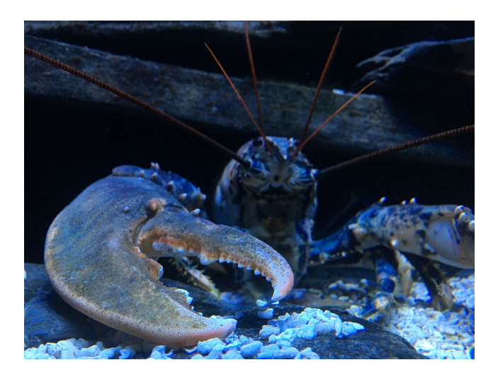
FIGURE 1 An adult male European lobster ( Homarus gammarus )

Part of this uncertainty arises from the challenge of identifying hatchery-reared lobsters once they are admixed with natural stocks in the wild. A few approaches have been employed to distinguish hatchery lobsters from their wild counterparts; typically, these involve the insertion of small internal tags that are retained through ecdysis (Ellis et al., 2015). However, these approaches have relied on