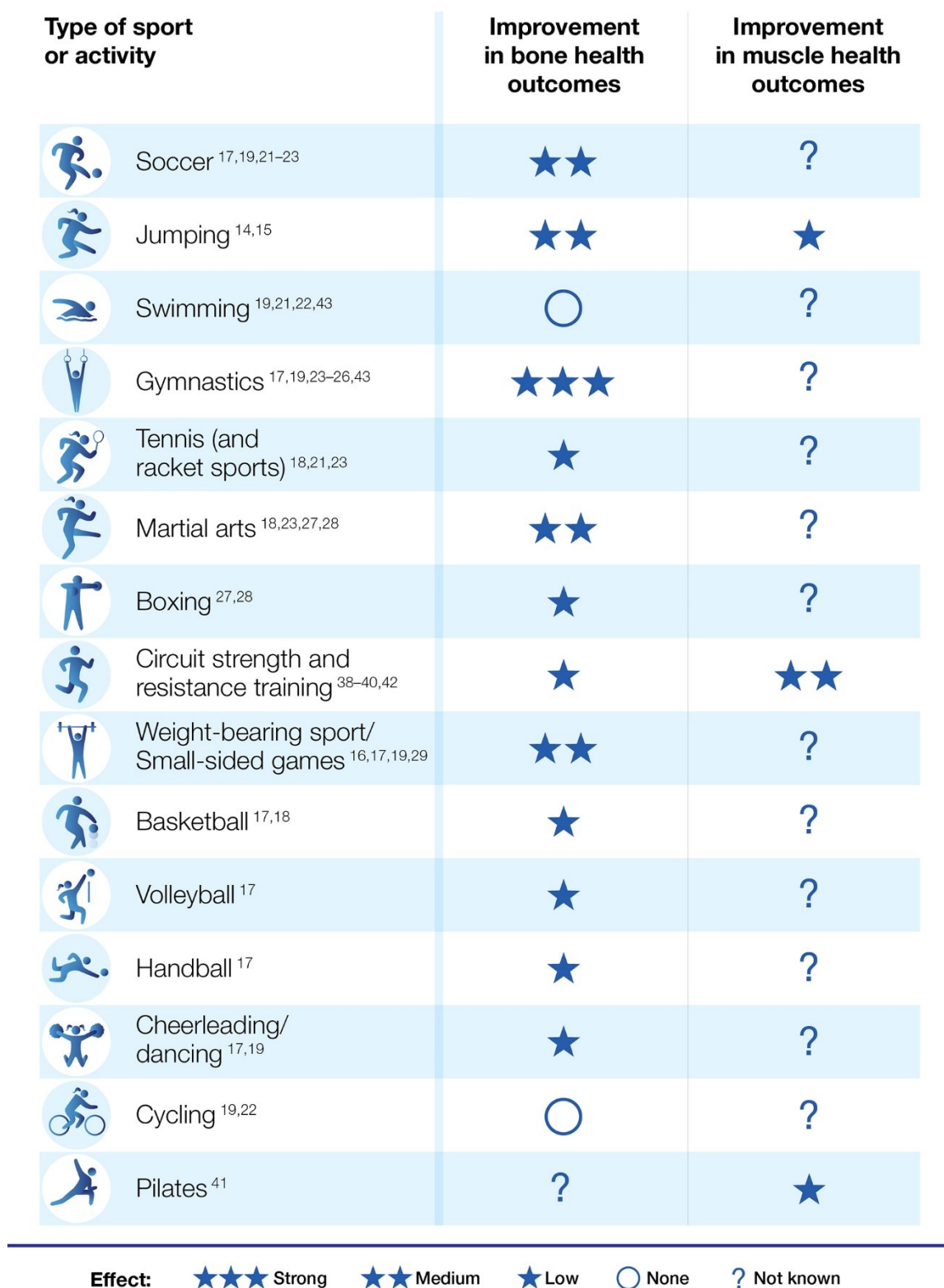
Table 1. Summary of the strength of the association between each type of physical activity and bone health and muscular health outcomes