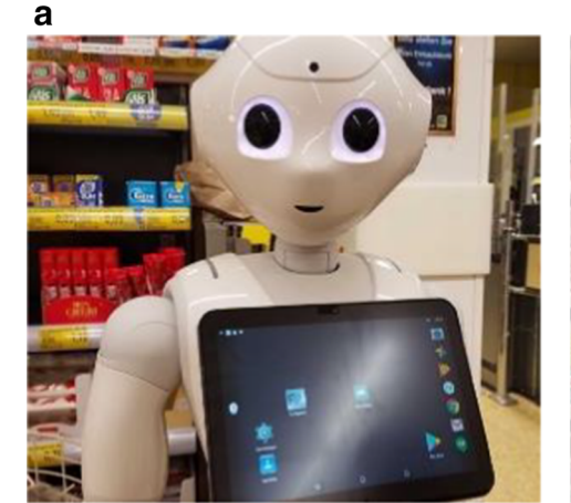
Fig. 1 Recent examples of the Pepper robot 'in the wild'. a The social robot was placed at the customer checkout in a German supermarket and reminded shoppers of new hygiene regulations to ensure public health in April 2020, during the global coronavirus pandemic. b Pepper in a Dutch souvenir shop at Schiphol airport.