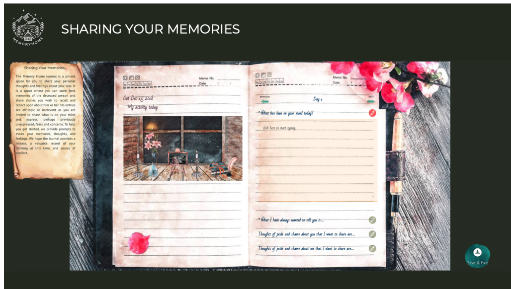
Fig. 2. Living Memory Home writing exercise.