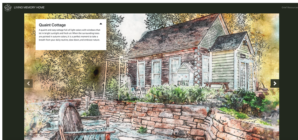
Fig. 3. Living Memory Home selecting home base exercise.

Overall, the LMH was created through a co-design process that incorporated feedback from 4 multidisciplinary experts with research experience in grief study, mental healthcare and medical application development and stakeholders who had experienced the loss of a loved one. The activities and features of LMH (e.g. writing exercises, digital mourning space) were created based on best practices drawn from bereavement and grief literature (e.g., Neimeyer's Techniques of Grief Therapy [56] and Litz's internet-based grief intervention in applying constructs of Cognitive Behavioral Therapy [45]) which were further refined based on the expert's field experiences. In the LMH, users would have the opportunity