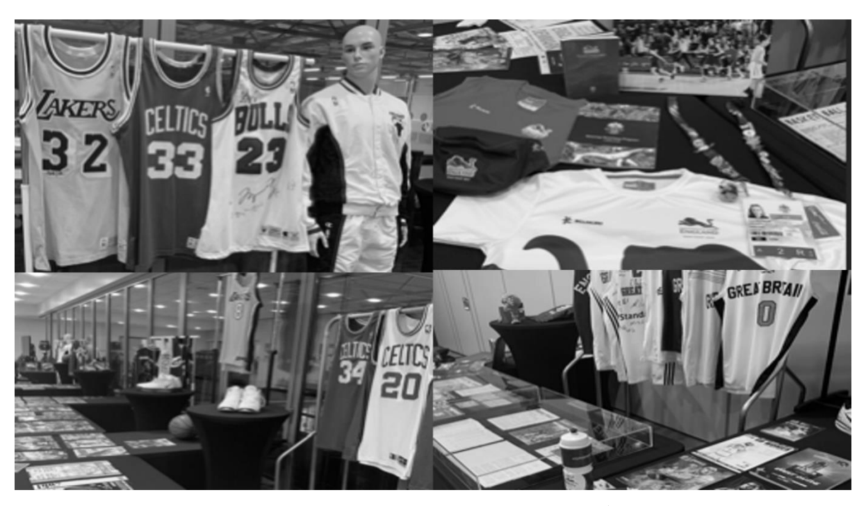
Figure 1. Collation of images from the NBHC exhibit, January 31st, 2020.