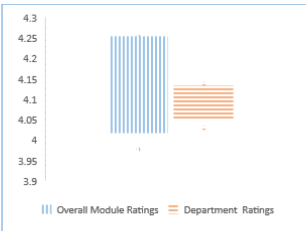
Fig. 2. Course Rating-Postgraduate Students

The quantitative feedback ratings and sentiment analysis from both groups of students are generally positive and above average, giving us a form of encouragement that the learning expectations of these students are met. The average ratings also do not set off any alarms with the teaching management or the subsidizing agency over the years. As part of the continuous improvement of our course, we review the