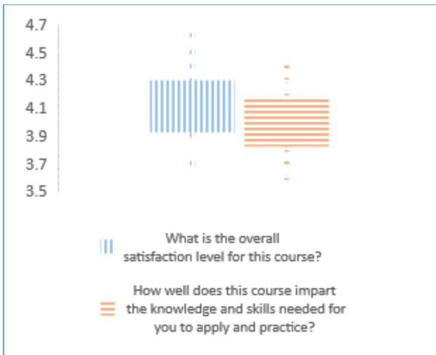
Fig. 1. Course Rating-Public Participant