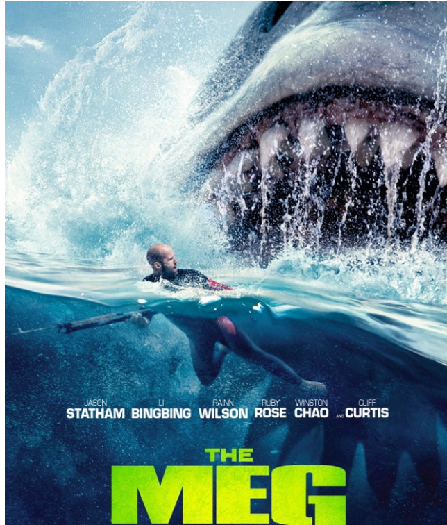
Figure 2: The Meg (Jon Turteltaub, USA, 2018), Publicity Poster. ©Apelles Entertainment, Di Bonaventura Pictures, Flagship Entertainment Group, Gravity Pictures (presents), Mayday Productions. Reproduced under Fair dealing provisions.

This century-old colonial cinematic perspective reveals subtextual gendered and racial biases continuing in cinematic depictions with apex nonhuman films; and as far back as the early depictions in cinema such as King Kong , nonhumans are utilised as a violent terrorising metaphor for the fear of the ‘other’, including other races, raising underlying intersectional issues and also always portraying women as ‘vulnerable to attack’, as ‘the victim’.