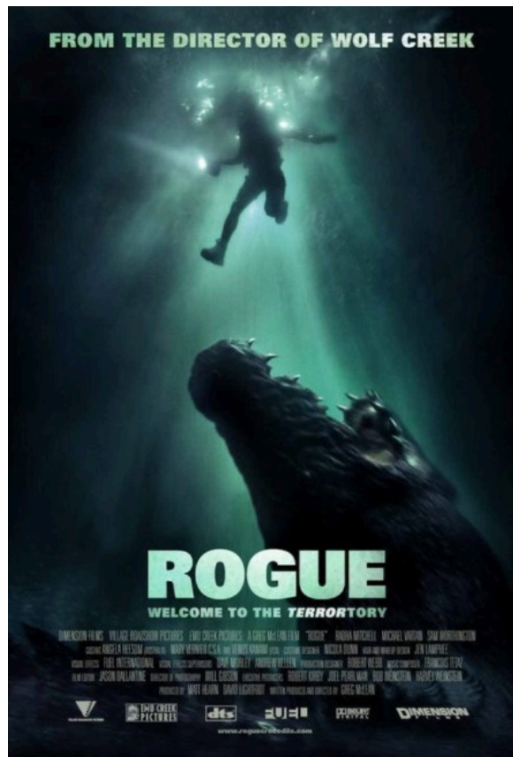
Figure 3: Rogue (Greg McLean, Australia, 2007), Publicity Poster, ©Dimension Films (presents), Emu Creek Pictures, De Naray Sothcott Entertainment, Village Roadshow Pictures. Reproduced under Fair dealing provisions.

Catherine Simpson and Maja Milatovic have both positioned Australian films Rogue (Figure 2) and Black Water (David Nerlich, Andrew Traucki, Australia, 2007) (Figure 5) within a broad post-colonial narrative of tourism as ‘transgression’. This is into the territory of an animal and also into an area significant to Indigenous peoples, for which, the animal exacts ‘retribution’. These ‘revenge narrative’ films are examples of the cinematic subgenre of Ecohorror (Simpson; Rust and Soles).