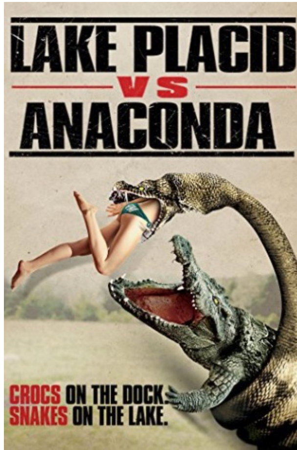
Figure 4: Lake Placid vs. Anaconda (A.B. Stone, USA, 2015), Publicity Poster, ©Curmudgeon Films, Syfy (in association with), UFO Films. Reproduced under Fair dealing provisions.

In the feature film Black Water (David Nerlich, Andrew Traucki, Australia, 2007) use of the phrase ‘Based on true events’ in publicity materials (Figure 5) enhances the affect. This film received theatrical release in Australia classified at the higher MA15+ rating ‘considered unsuitable for persons under 15 years of age it is a legally restricted category’. The DVD release was tagged with an audience advisory of ‘Strong Violence’ (Australian Classification ‘Black Water’). Black Water was released for theatre screenings in the UK at the ‘15’ rating, with the audience advisory ‘Contains strong language, threat and bloody injury’ (British Board of Film Classification ‘Black Water 2007’). As in the publicity poster for Lake Placid vs Anaconda