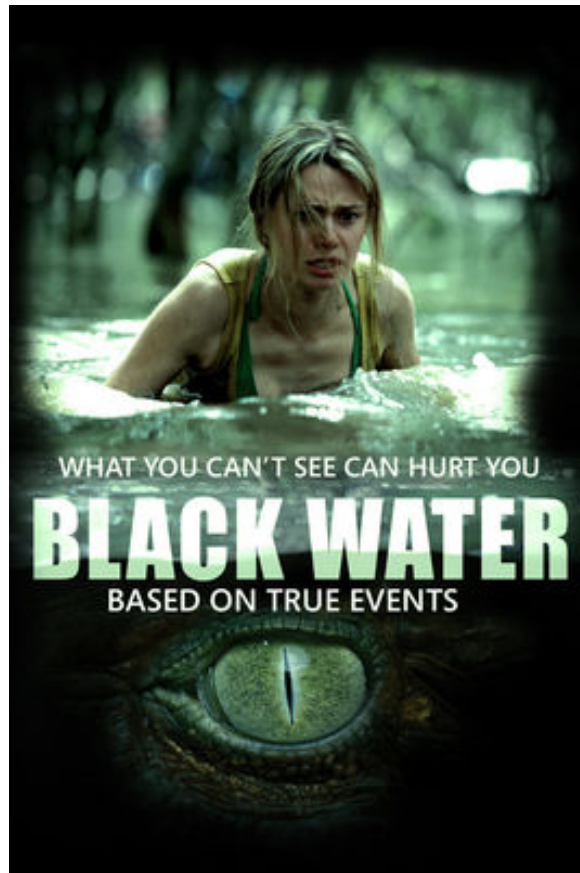
Figure 5: Black Water (David Nerlich, Andrew Traucki, Australia, 2007), Publicity Poster, ©The Australian Film Commission (presents), Territorial Film Developments (TFD) (presents), Prodigy Movies. Reproduced under Fair dealing provisions.

(Figure 3), the subjects of the terror are white women. Black Water sensationalizes accounts of crocodile-human ‘incidents’ in the Northern Territory and is classed as an Action-Adventure-Drama (International Movie Database 2007c). In discussion of the film’s use of the term ‘incidents’ (as a substitute for ‘attacks’) follows use of the term in relation to sharks (Neff).