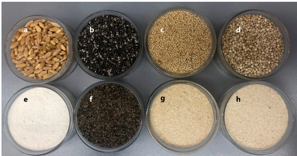
Figure 1. Raw materials: wheat grains (a); chia seeds (b); amaranth grains (c); quinoa grains (d); wheat flour (e); whole chia flour (f); whole amaranth flour (g); whole quinoa flour (h).

of the sensorial attributes studied for the quinoa factor indicated that the more this ingredient was added, the worse the loaf, texture, flavour, and the product's overall acceptability became (Table 3). However, when amaranth was included, consumers gave crumb texture and the product's overall acceptability acceptable values. According to the 9-point hedonic scale, the texture attribute scores varied from 3.40 \pm 0.05 to 8.5 \pm 0.7 , and the product's overall acceptability score went from 2.7 \pm 0.5 to 8.4 \pm 0.2 . The higher scores of these two attributes were for the control bread, followed by formulation A 20 (texture: 6.3 \pm 0.2 and overall acceptance: 7.3 \pm 0.3 between "Moderately like" and "Very much like"), which remained some way behind those obtained in control bred (CB) (texture: 8.5 \pm 0.7 and overall acceptance: 8.4 \pm 0.2 , between "Very much like" and "Especially like") (Table 3). No significant interaction was detected between either quinoa and chia ( a_{12} ) or quinoa and amaranth ( a_{23} ).