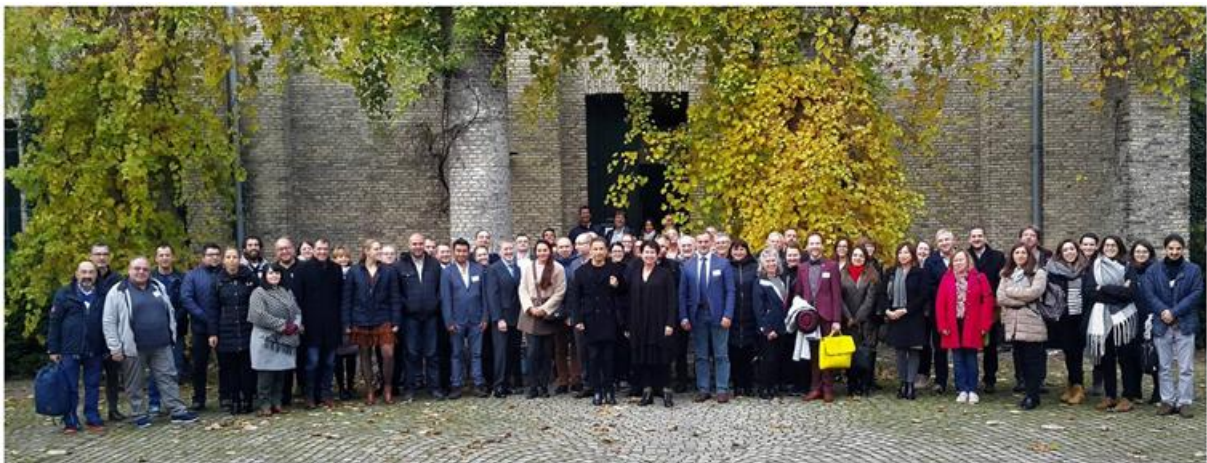
Participants of RIBMINS workshops and working group meetings held at the University of Copenhagen, Denmark (7 th - 8 th November 2019)

The RIBMINS network scope of work, ongoing activities and news can be regularly followed at www.ribmins.com , as well as through social media ( Twitter , LinkedIn , ResearchGate ).